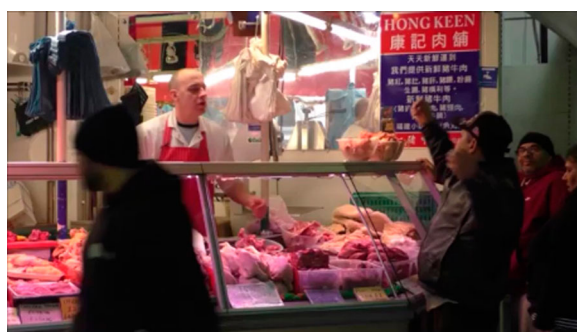
Figure 3. Customer open his arms wide again.