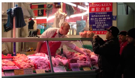
Figure 2. Customer brings his hands together.