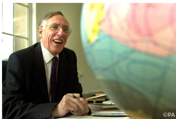
Donald Dewar: last Scottish Labour leader to look the part?

Labour's problem is that, since Dewar's untimely death, it has lacked a leader of comparable public stature to Alex Salmond. Perhaps for this reason, perhaps also because of weaknesses in their repertoires of skills, none obtained mastery of their party.