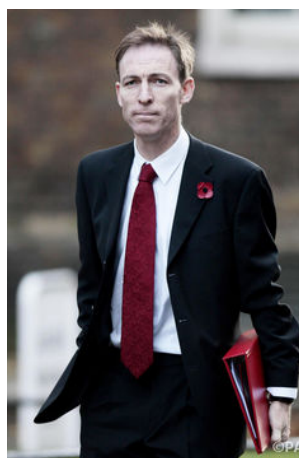
Murphy: Scottish Secretary days

Murphy will be well aware is that he is Scottish Labour's eighth leader in 15 years (counting current caretaker leader Anas Sarwar, who did not run). There seems to be little security of tenure in the post. After Donald Dewar, the first of them, died in post, the rest have tended to be edged out either because of a minor misdemeanour or after an election defeat. But the underlying reason was that they all struggled to gain and retain the confidence of their party. Why?