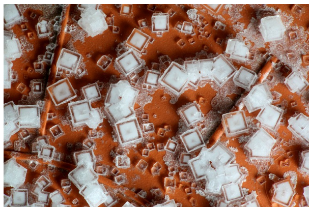
Table salt crystals.

Meanwhile, researchers at Nottingham University are looking into nanoscale salt particles than can increase the saltiness of food without increasing the amount of salt.