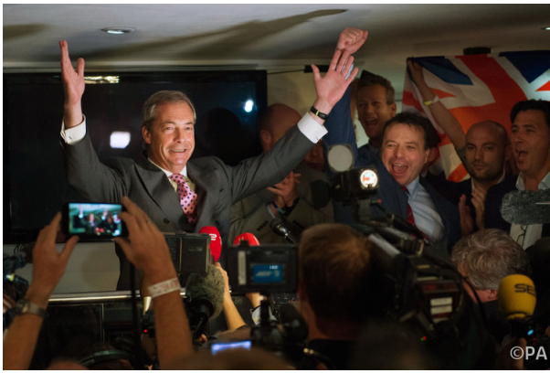
Time for the Brexiters to deliver.