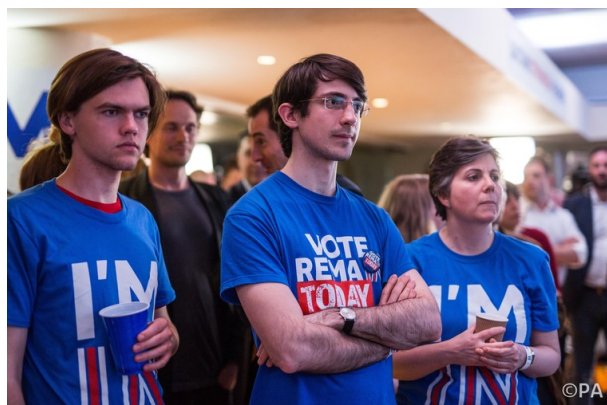
The news sinks in for Remain campaigners.

something that potential immigrants might want to consider.