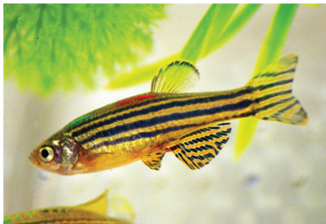
FIG. 1. A zebrafish tagged with elastomer injected beneath the skin. Visible are two colored marks (green and red) on the dorsal side. Color images are available online.

After 3–4 months of holding and testing, the parental generation in the facility began to experience higher