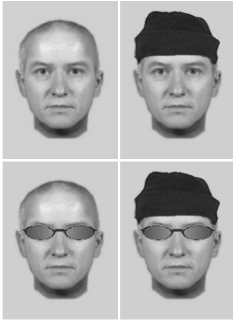
Fig. 3. Example composite constructed from memory by a participant in Experiment 3 of EastEnders' character Alfie Moon (played by actor Shane Richie), top left, and different representations, edited with selective concealments (woolly hat and sunglasses). Images were presented together as an array. In this example, the composite constructor initially saw a target photograph with inaccurate hair (a bald head in this case).