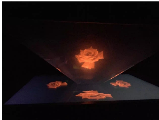
Figure 4: 'Affective Assemblage Hologram'