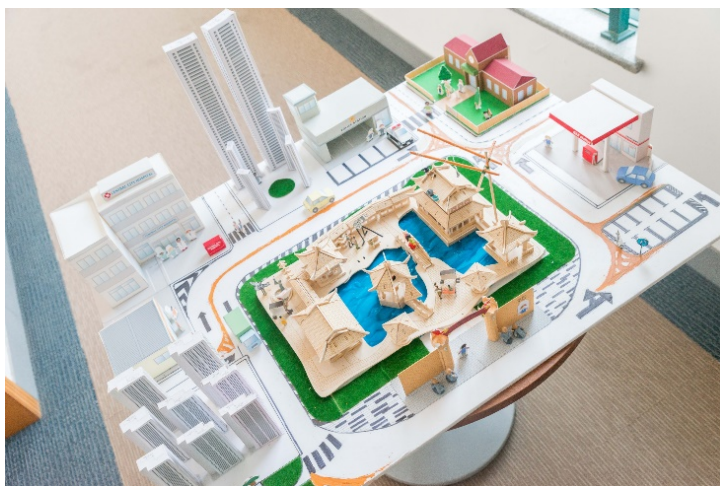
Figure 2: 'Heterotopia in a Discipline Society'