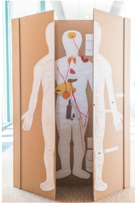
Figure 3: 'Embodied Assemblage'