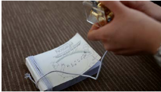
Figure 6. 'Communication as Movement' (flipbook with music box)