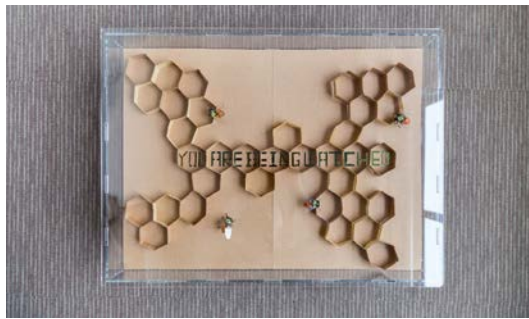
Figure 6a. 'Discipline Society – You are Being Watched'