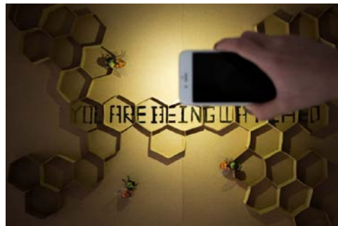
Figure 6b. 'Discipline Society – You are Being Watched'