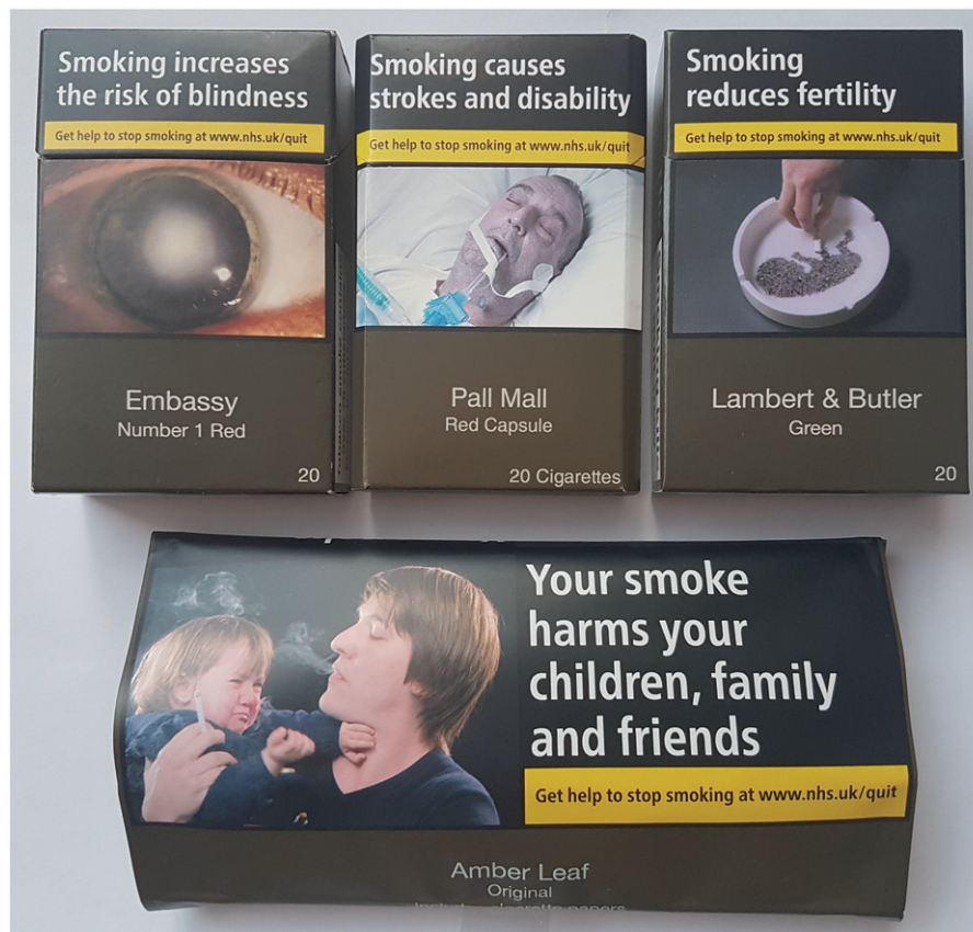
Figure 1. Standardised packs used in the survey.

Regulations (TRPR) requires pictorial warnings covering at least 65% of the principal display areas and text warnings on at least 50% of the secondary display areas. Prior to the legislation, in the UK a text warning covered 43% of the front, and a pictorial warning 53% of the back, of packs. The TRPR also requires the inclusion of cessation resource information (e.g. a stop-smoking helpline and/or web address) on each warning, with the UK Government opting to include a stop-smoking web address (Figure 1 shows standardised packaging in the UK).