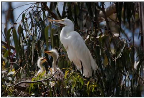
Illustration 2: Great Egret (Ardea Alba 2009)

Holguín's translation of the bird is an accurate description of what he must have seen (1), the term "huaccarpaña vña" apparently only referred to the white baby llama as sacrificial animal (2) and was probably elicited from his consultants. We do not know whether this kind of sacrifice was still being made at the beginning of the 17th century, but the chronicler Cieza de León still witnessed it in the 1550s. 43 Despite the uncertain etymology the 'sacred' character of this animal moved González Holguín to suggest it as equivalent translation for Agnus Dei.