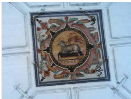
Illustration 4: Agnus Dei - The Lamb of God on the Book with Seven Seals. Iglesia de la Anunciación, Sevilla, España, 1616 45

In the Western biblical tradition, the white lamb, Agnus Dei , is a common element in the liturgy of the mass, a metaphor for the Eucharist, and as such it has also been widely used in iconography (see Illustrations 4 and 5). 44