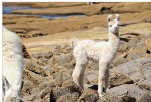
Illustration 3: Baby Llama ([2008])

verb "huacca-" means 'to comb the wool by hand', ibid. ). It is possible that this is connected to the custom to use (still at present) the fine wool from the llama's neck to weave ceremonial garments (Lindsey Crickmay, personal communication, 17 January 2017). In Quechua pañã means 'right hand, right-hand side' (González Holguín 1608, Qu-Sp: 274, 1989: 277), but it is not an Aymara word (Bertonio [1612] 1984, Sp-Ay: 207). In Quechua the additive meaning of the elements as a word-for-word translation (*white heron – right-hand side) does not make much sense, and it is possible that the word as a whole (and its meaning in religious ritual) is a loan from another language (such as Puquina), possibly adapted through a folk-etymology.