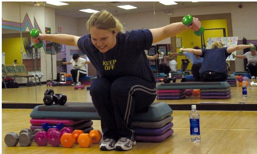
Figure 10.6 Social identity can get in the way of support seeking

in groups that embrace masculine norms (e.g., of ‘toughness’) may experience barriers to seeking out social support that attends to their emotional or physical needs. Amongst other things, such norms have been found to be a barrier to male athletes seeking out mental health support (Moreland, Coxe, & Yang, 2018) as well as treatment for concussion (Kroshus, Kubzansky, Goldman, & Austin, 2014).