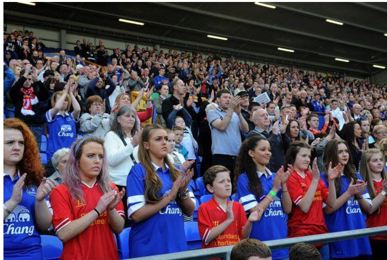
Figure 10.4 Liverpool and Everton fans stand side by side at a Goodison Park memorial service for victims of the 1989 Hillsborough disaster.