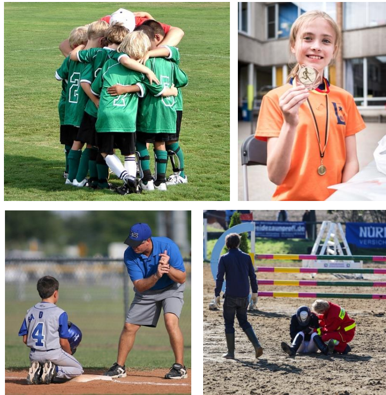
Figure 10.2 Social support is a universal feature of sport

Note: Support comes in many different forms: emotional, esteem, informational, and tangible.