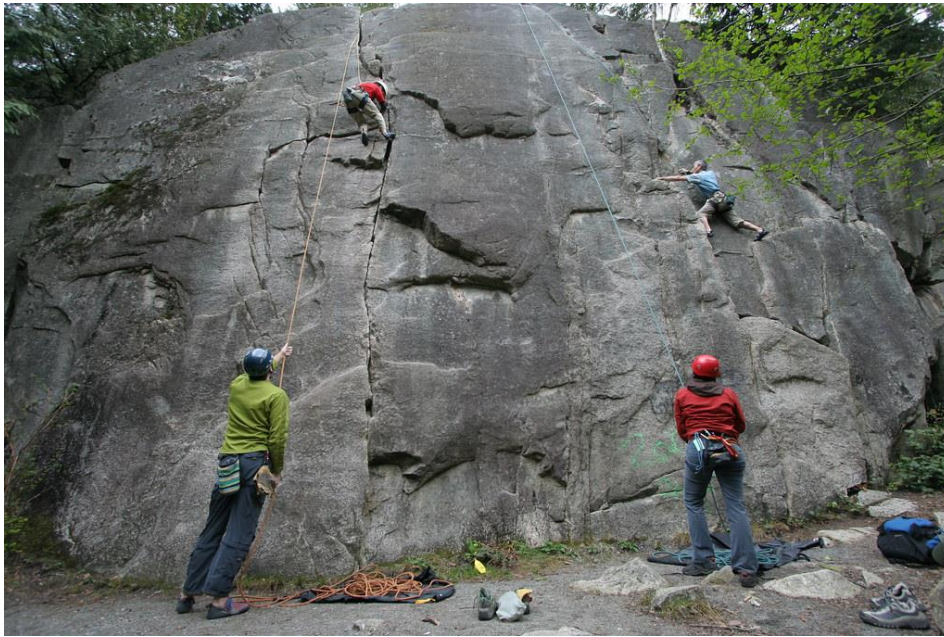
Figure 10.1 Perceived and received social support

Note: Perceived and received social support are both central to sport. In the case of rock climbing, climbers typically receive support from the belayers who hold their ropes but they also perceive other types of support to be available — as those belayers can also provide tactical advice and encouragement if needed.