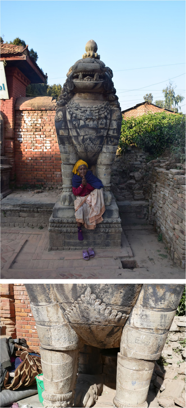
Fig. 4 Shifted and extruded stone blocks in a lion sculpture at Bhaktapur