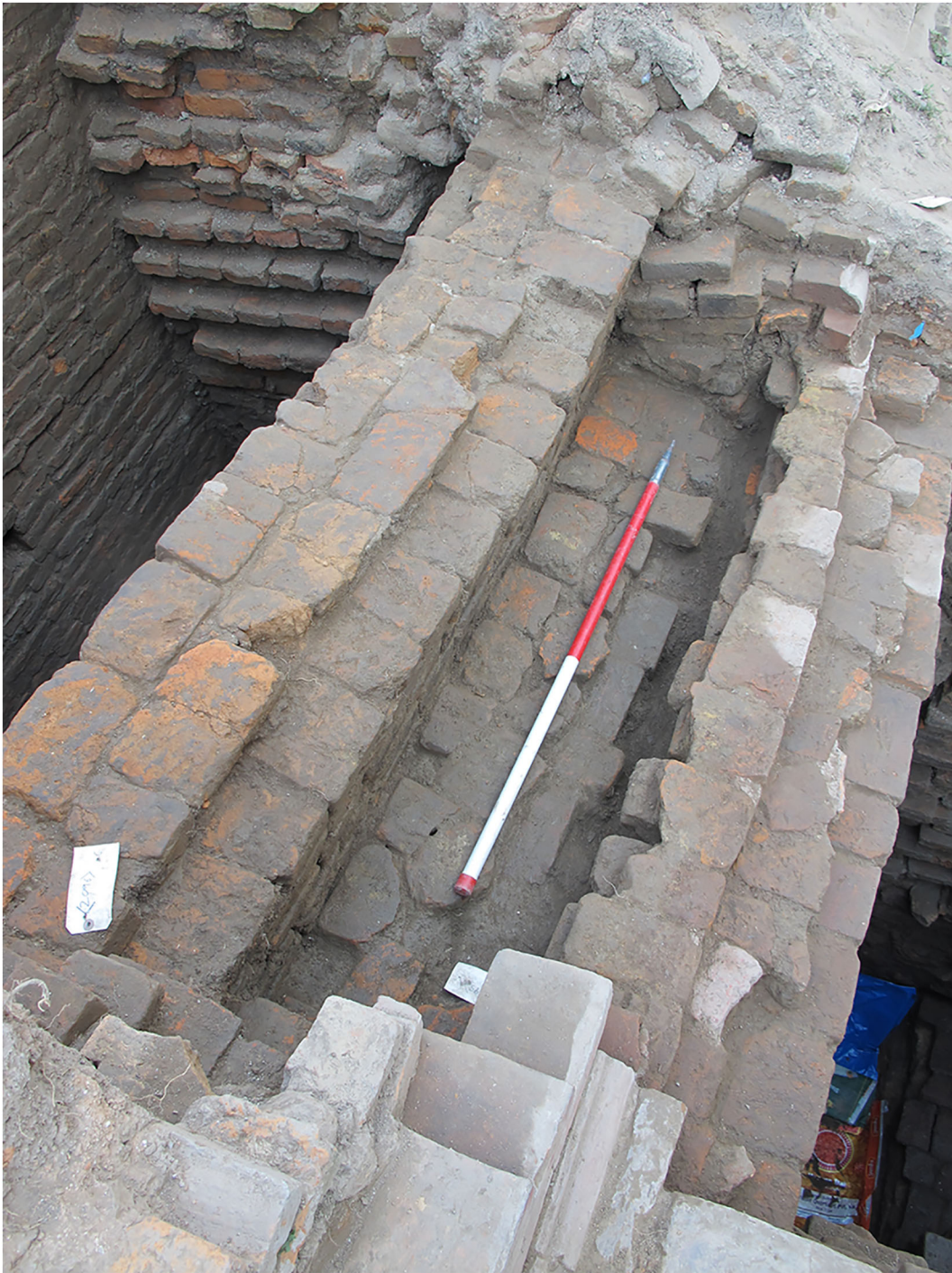
Fig. 7 Deformed and tilted wall, with later bracing, at Jaisidewal Temple

stones had traces of copper sheeting on their surface, and these may have acted as a damp course between the wooden pillar and the saddle stone, a response to the annual monsoon (Coningham et al. 2016d).