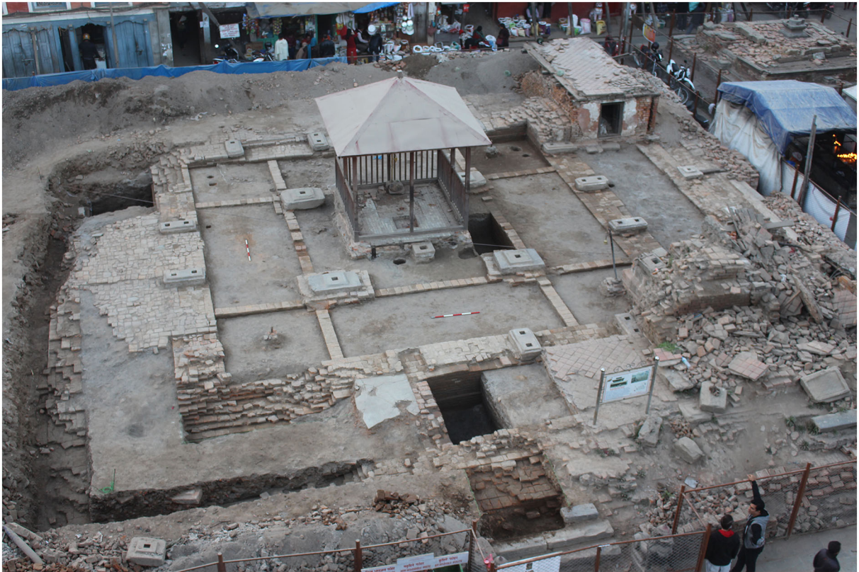
Fig. 9 Nine-celled mandala formed through brick-piers, foundation wall and cross-walls uncovered during archaeological assessments at the Kasthamandap