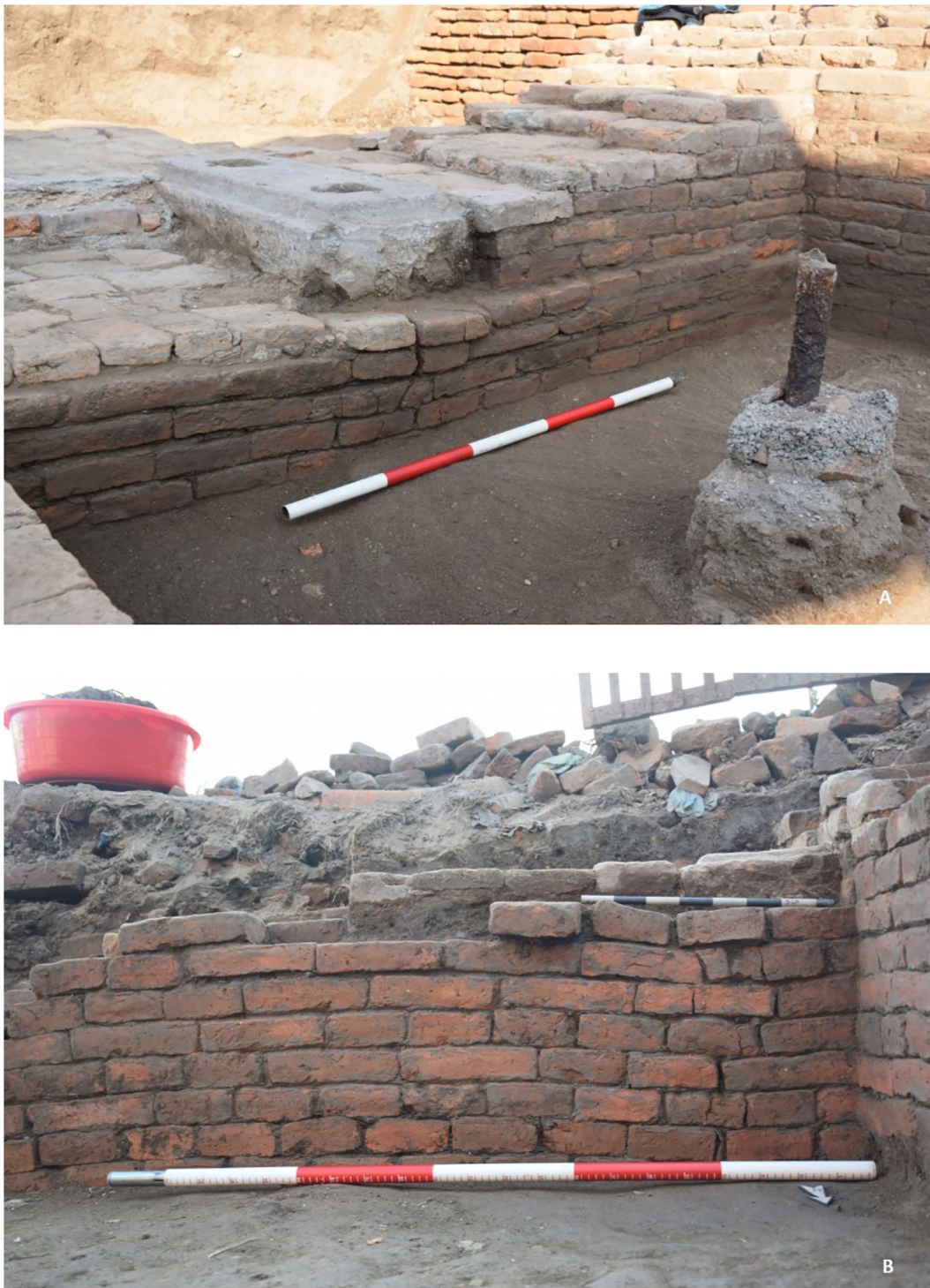
Fig. 10 Vertical cracks identified below a double saddle stone in the foundations of the Kasthamandap (a) and below a saddle stone in the foundations of the Gurujyu Sattal, Pashupati (b)

in the future, we began to co-develop archaeological approaches to assess and protect movable objects and