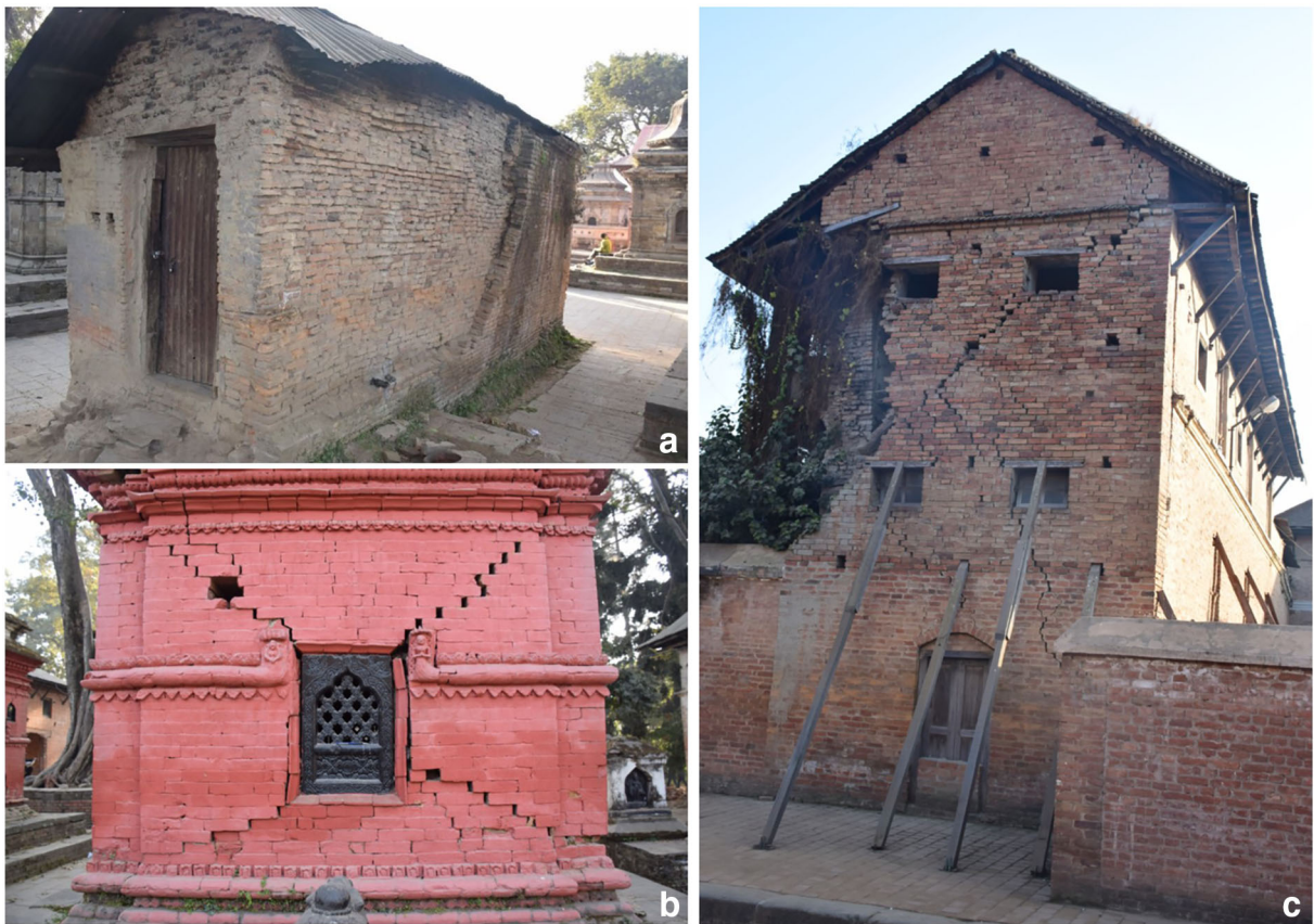
Fig. 3 Tilted wall at a structure at Mrigasthali in Pashupati (a); ‘X’ fracture through a brick built shrine at Mrigasthali in Pashupati (b); shear cracks through one of the walls within Bhaktapur Palace Complex (c)

this being the location where architectural stresses would be higher. Extrusions and the shifting of masonry blocks was also identified, both at collapsed monuments such as the Vatsala Temple in Bhaktapur (Coningham et al. 2016b), but also within the lion statues that are located just within the western gateway of Bhaktapur’s Durbar Square, which now flank the entrance to the Shree Padma Secondary High School (Fig. 4).