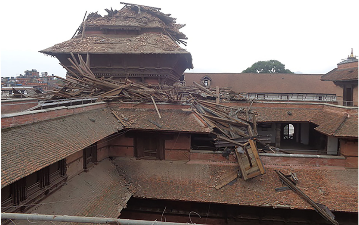
Fig. 2 Damage to the nine-storey palace in Hanuman Dhoka after the 2015 Gorkha Earthquake

developing an ancillary path for the preparation of historical seismic catalogues (Guidoboni and Ebel 2009: 418–472). On the other hand, archaeology provides extraordinary evidence for the understanding of past seismic adaptation and preparedness (e.g. Forlin and Gerrard 2017 for late medieval Europe). Frequently, the starting point for such a study is the use of textual sources to identify locations and dates of historic earthquakes. South Asia is no exception, with the vast majority of recorded earthquake events in textual sources dating from the sixteenth century onwards (Bilham 2004). However, archaeoseismological methods can also be used to identify earlier earthquakes through distinctive damage patterns within excavated sequences, as well as assessments of the fabric of historic standing remains. Such archaeological evidence can be used to identify earthquakes where no textual records are present, or in an attempt to augment the usually poor time resolution of events recorded in textual sources (Ambraseys 2006; Galadini et al. 2006; Silva et al. 2011; Sintubin 2011; Stiros and Jones 1996).