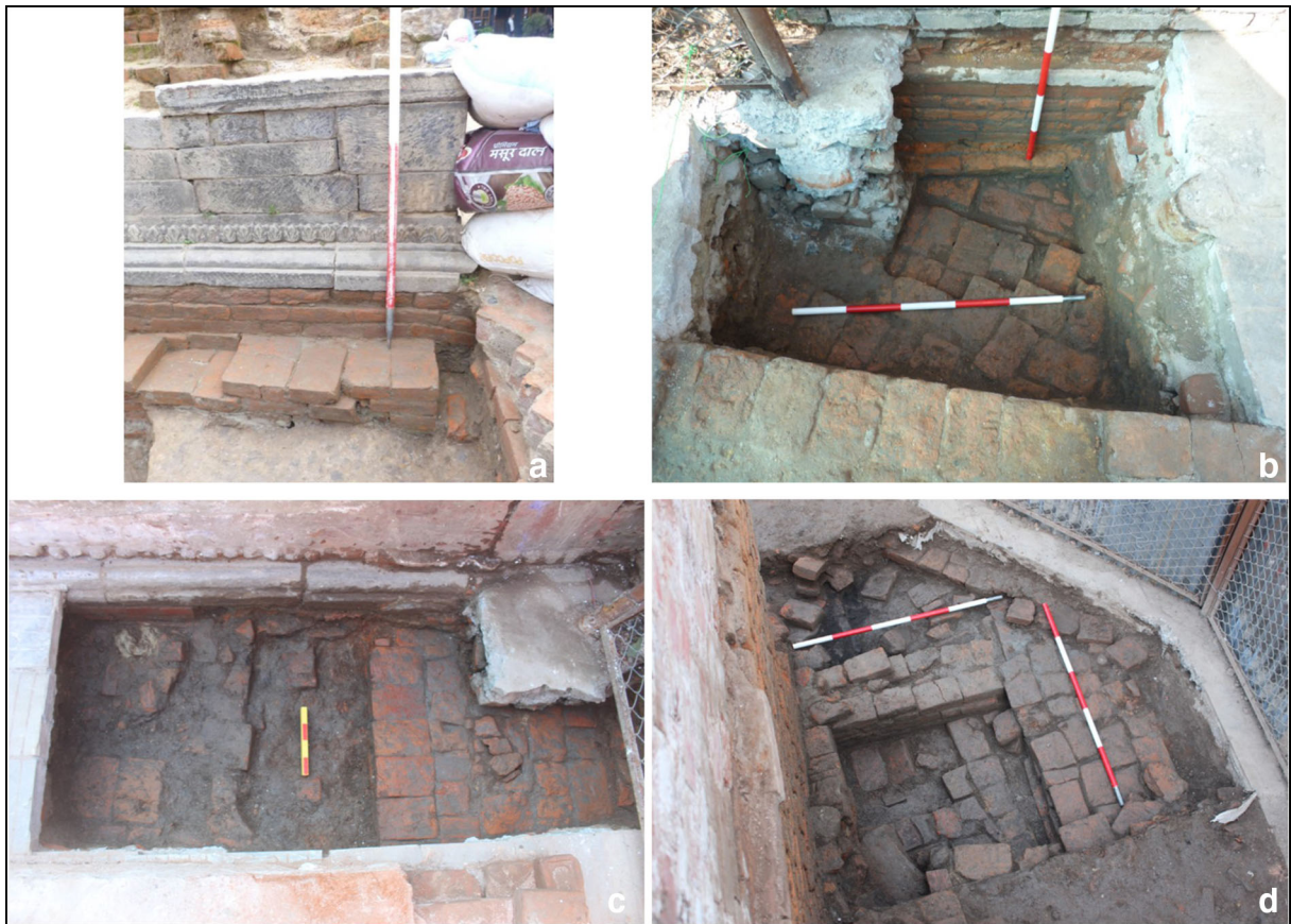
Fig. 6 The current footprint of the Vatsala Temple in Bhaktapur overlaying and overhanging an earlier brick foundation (a); a large brick wall on a differing alignment running under the plinths of the

Maju Dega Temple, Hanuman Dhoka (b); a structure located below the Trailokiya Mohan Temple to the east (c); and a further structure identified to the south (d)