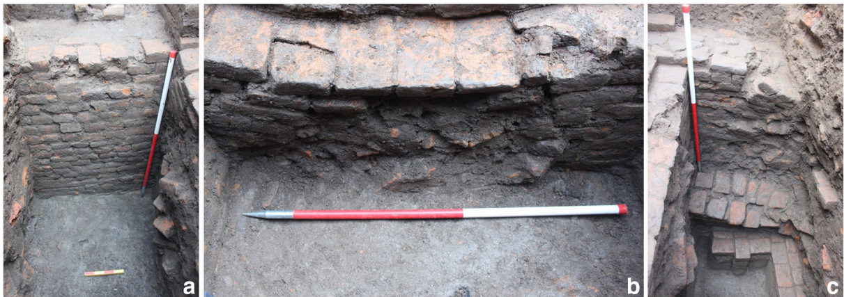
Fig. 8 Trench to the southwest of Jaisidewal Temple, with sequence of brick walls exhibiting shear crack and slight extrusion (a); tilting and collapse (b); crack and collapse of upper wall; and tilting of lower wall below (c)

identified that this had most likely occurred during conservation in the mid-twentieth century, where the rotten tenon of the large northeastern pillar was pushed into the socket below and then covered over by the tiled surface, rather than being replaced, which would have maintained the direct link between superstructure and foundations. This was likely to be a major contributing factor towards the Kasthamandap's collapse, as we found no major or catastrophic earthquake damage within the brick piers or foundations exposed during archaeological assessments, and no significant damage was reported for the monument in relation to the 1934 earthquake.