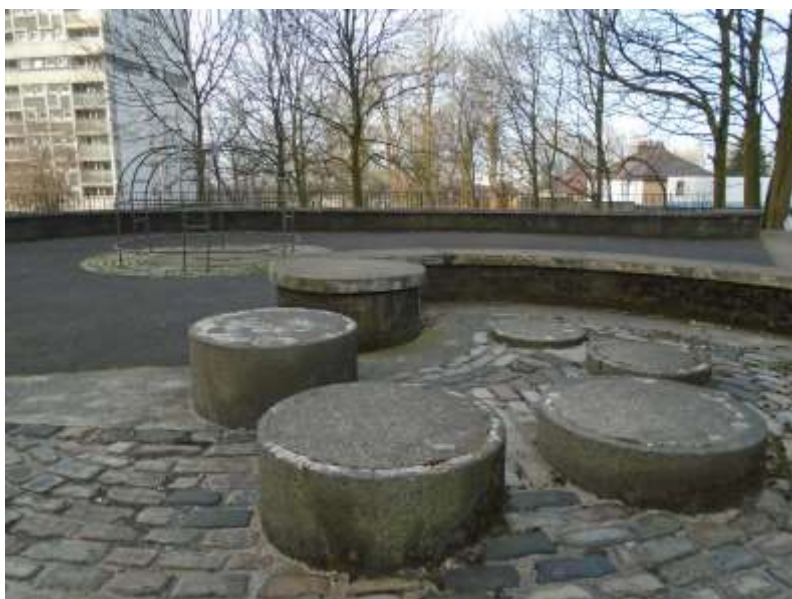
Figure 4: Playground at Broomhill high flats, Glasgow, June 2015