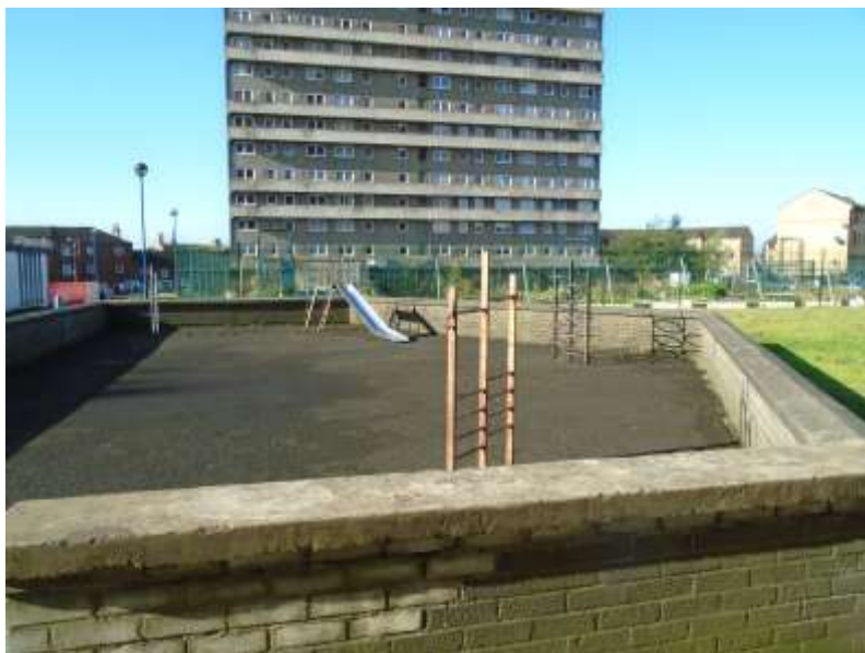
Figure 5: Playground at Cedar Court high flats, Glasgow, October 2015