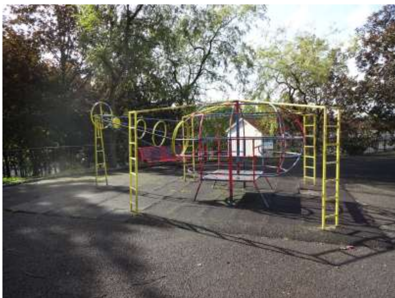
Figure 6: Playground at Moss Heights high flats, Glasgow, April 2016

In the 1990s and early 2000s we see echoes of the past and repeated shortcomings. While the planning of services and amenities moved into the realm of partnerships between public, quasi-public and third sector organisations, and community involvement was seen as central, communication was with adult representatives rather than children, despite international developments in children's rights and participation at this time. 70 The events-led approach to city wide regeneration also continued with the development of a city marketing bureau in 2004 to attract tourists, conferences and sports meetings to the city. 71 In this regard, selling Glasgow's image as the 'Dear Green Place' was important so that the upkeep and development of the city's main parks was perhaps the priority rather than caring for, or making, additional local provision for outdoor play. Access to such parks and open spaces was also very uneven and dependent on the ability to travel as determined by financial resources and the age of the child.