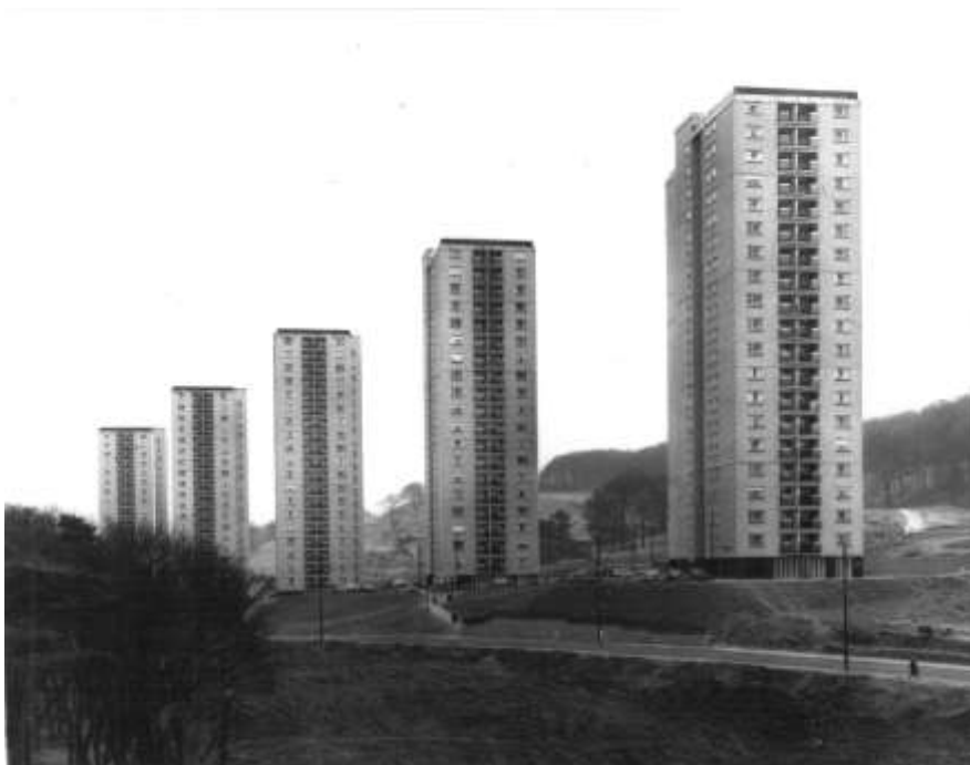
Figure 2: Mitchellhill Flats, Castlemilk (late 1960s), University of Glasgow Archive Services, Homes in High Flats Collection DC127/22a