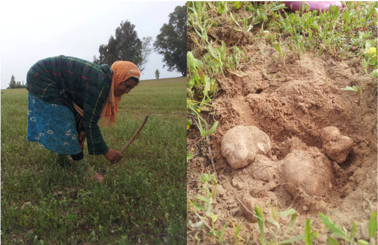
Fig. 2 Desert truffles ( Terfezia arenaria ) being located in Morocco using the “stick” method (left) and freshly unearthed fruiting bodies (right).