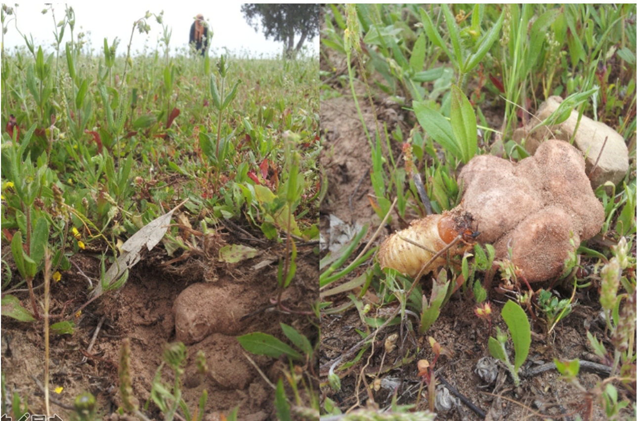
Fig. 3 Desert truffle ( Terfezia arenaria ) in the soil (left) in Morocco and an example of larvae (unidentified) that are occasionally found in close proximity to the fruiting body (right). Note: these larvae do not seem to damage the truffle, but may benefit from the locally elevated moisture levels.