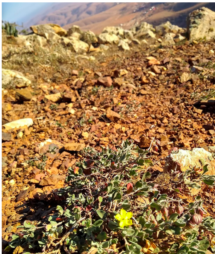
Fig. 4 Helianthemum canariensis , a host plant for Terfezia canariensis , growing in the mountains of Betancuria on the island of Fuerteventura.

Endemic to the islands and associating with the local Helianthemum species, H. canariensis , this species can occur from coastal sites to as high as 600 m elevation (see Fig. 4). As with other desert truffle species, this truffle fruits after rainfall events, which is when locals can often be seen gathering them in some quantities. Despite the recent volcanic history of the Canary Islands, H. canariensis seems to favor soils derived from sedimentary rocks and especially those with a high calcium content.