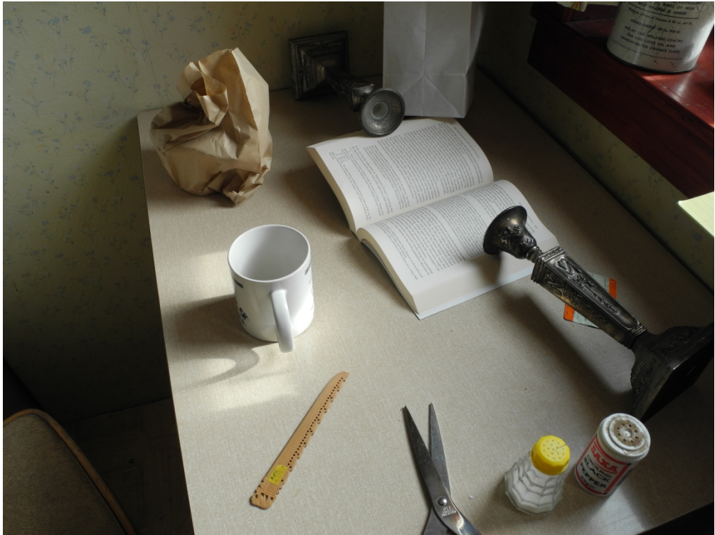
Kitchen Table at Lunchtime [digital photograph].