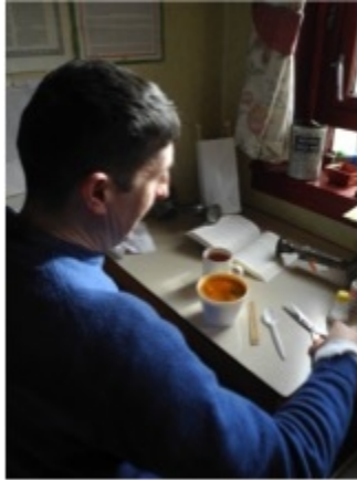
Artist and the Lunchtime Hiatus [digital photograph].