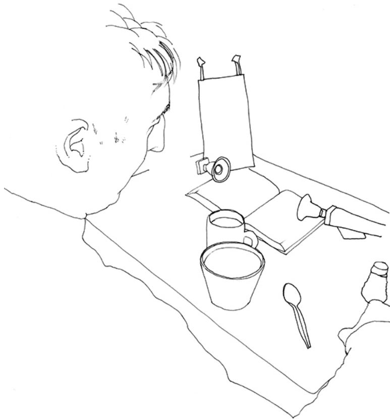
Drawing One [photo-traced line drawing. Image Credit: Author 26x38mm (600 x 600 DPI)