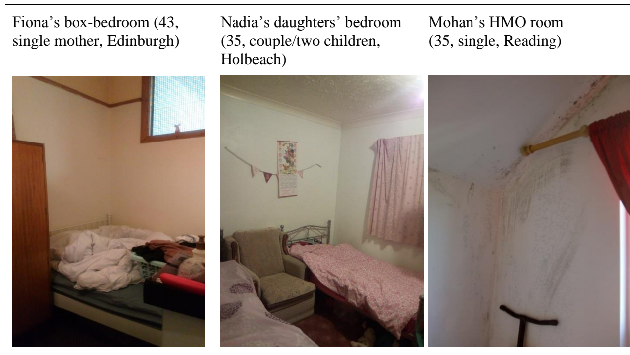
Figure 1. The uninhabitable

Fiona's 10 photos and her emphatic narrative gave a 'thick' description of what she felt like inhabiting an uninhabitable space (Simone 2016); five more participants felt similarly about their living conditions (three 'younger, three 'older'). Figure 1 illustrates this point. Of the eight participants describing their current rooms or flats as being in extreme disrepair, only two