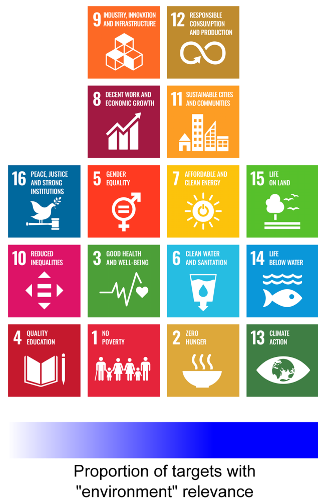
Fig. 2 The importance of environment within each SDG, based on a textual analysis of SDG target wording (as per UN 2015). The vertical scale is linked to the proportion of targets within each SDG that contain at least one environment-related word (Environment-related words were counted within each SDG target, and include: air, animal, aquaculture, aquifer, biodiversity, clean energy, climate, coastal, communicable disease, drought, dryland, ecosystem, environment, fauna, fish, flood, flora, forest, genetic diversity/resources, green space, hepatitis, lake, land, livestock, local product, malaria, marine, mountain, natural, nature, neglected tropical disease, ocean, pastoralist, peri-urban area, plant, renewable energy, resource, river, rural area, sea, seed, services, soil, species, terrestrial ecosystem, tuberculosis, water, weather, wetland, wildlife. The count included close relatives of each word, e.g. *fish* also selected fishing, fisheries, overfishing, etc.), and ranges from no mention of the environment (SDGs 4, 10, 16) to environment mentioned throughout (SDGs 13, 14, 15)

To assess the environment–human aspects of the interactions between SDGs, we applied the logic explained above but focused only on action related to the environment–human linkages rather than the full range of possible actions to advance any one SDG. For example, some action used to achieve good health and wellbeing (SDG 3) is related to the environment–human linkages, e.g. vector