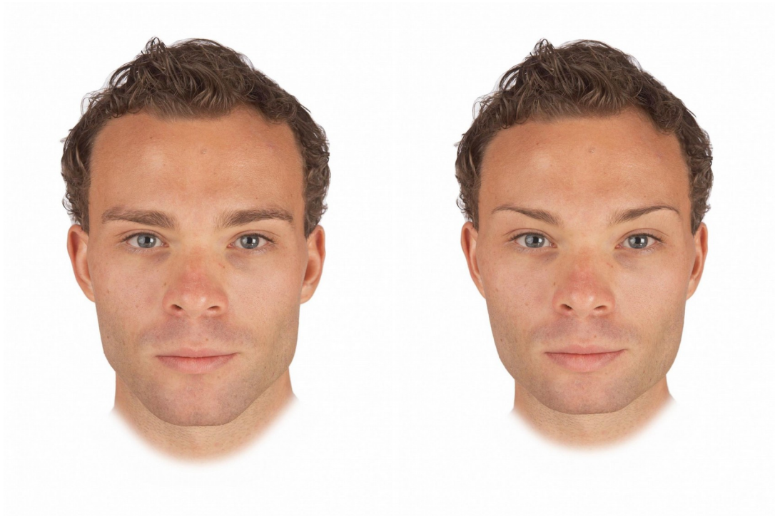
Figure 1. Examples of masculinized (left) and feminized (right) versions of men's faces used to assess facial masculinity preferences in our study.

Each participant completed two face preference tests (one assessing men's attractiveness for a short-term relationship, the other assessing men's attractiveness for a long-term relationship). Trial order within each test was fully randomized and the order in which the two face preference tests were completed was also fully randomized.