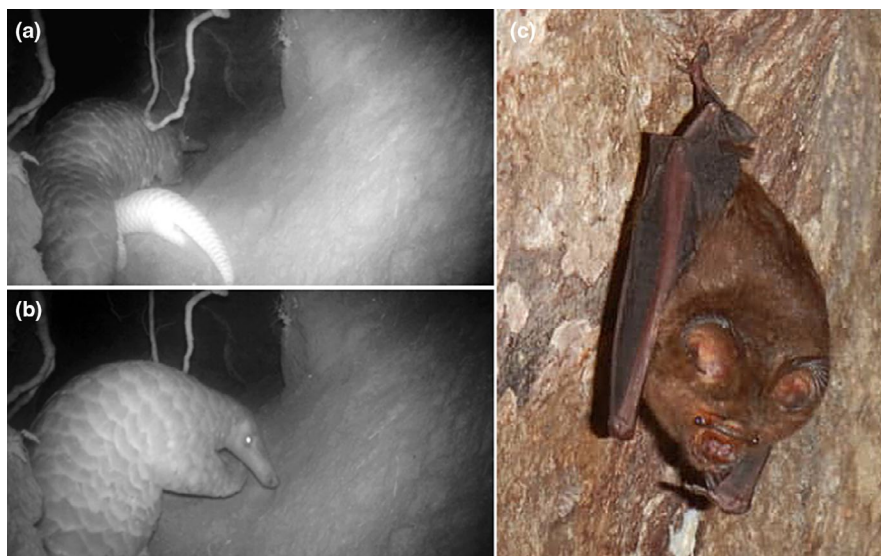
FIGURE 3 (a) Female and infant giant pangolin; (b) our focal male and (c) Hipposideros ruber are observed using the same burrow [Colour figure can be viewed at wileyonlinelibrary.com ]