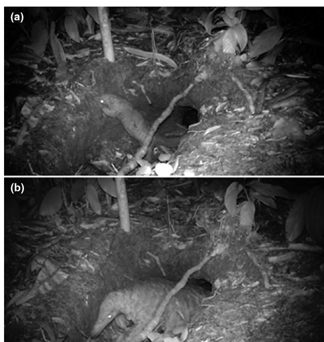
FIGURE 2 (a) White-bellied ( Phataginus tricuspis ) and (b) giant ( Smutsia gigantea ) pangolins emerging from the same burrow

females with infants that were never observed together. Six of the burrows were frequently visited by a large lone female; with whom the male was observed walking, feeding and interacting during successive nights. Burrows were rarely used on two successive nights. Two hollow trees were occasionally visited.