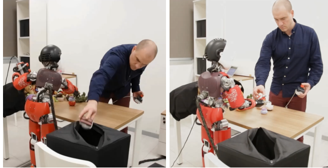
Fig. 1. Screenshots of the video stimuli: Low Coordination (left) and High Coordination condition (right).

chain in which the human grasps toys and passes them to the robot, whereupon the robot drops them into the container (Figure 1, right). In the High Coordination condition, the video lasts about 40 seconds; in the Low Coordination condition, the video lasts 37 seconds. In both conditions, the overall number of toys placed in the box is 4 (in the Low Coordination condition each agent puts two toys into the container; in the High Coordination condition all four toys are passed from the human to the robot).