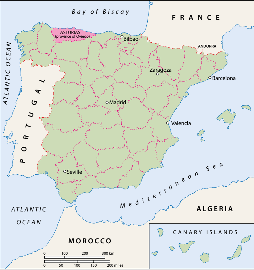
Map 1. The provincial division of Spain (map drawn by Cox Cartographic Ltd).