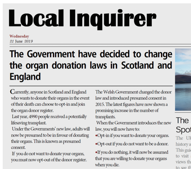
Fig. 3. Example of Condition 2: High Threat \times Gain Frame message.

Two framing manipulations (loss vs. gain) were used in this study. The first framing manipulation presented figures on the number of people who had died on the waiting list (loss): “Last year, 400 people died while waiting for a potentially lifesaving transplant,” and how many people’s lives had potentially been saved by an organ transplant (gain): “Last year, 4990 people received a potentially lifesaving transplant.” The second framing manipulation centered around a description of the opt-out system in Wales. As Wales was the first UK nation to introduce opt-out consent, information on Welsh rates of donation following the legislative change feature heavily within UK opt-out media campaigns. Therefore, the gain-frame manipulation described the opt-out system in Wales to have resulted in “a promising increase in the number of transplants” and in the loss/neutral frame manipulation “a small increase in the number of transplants.” The specific message variants used in each of the language and framing manipulations are available in Supplementary Information 2 .