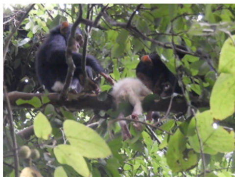
FIGURE 1 The dead body of the infant with albinism inspected by two infants, MZ and OZ, stroking its back and sniffing it, respectively.

At 7:54 a.m., FK approached the carcass again, picked it up, and moved 4 m away holding it by the foot. He bit part of the palm of the right hand of the carcass and immediately spat it out. MZ and OZ again approached the carcass to sniff it. At 8:09 a.m., FK placed the carcass in a tree branch and after grooming its back, moved around 7 m away to rest. At 8:25 a.m., ZL approached the dead infant, sniffed it, touched its penis and anus. ZL then inserted a digit into the anus of the carcass, moving the digit in and out before sniffing it. After 10 min of repeated manipulations and inspections of the corpse, ZL moved away. At 8:36 a.m., ST approached the carcass and inspected it by sniffing and touching it. ST was joined by KZ who also inspected the carcass. Both ST and KZ inspected, sniffed, manipulated, touched, and groomed the carcass repeatedly for 8 min. Notably, at 8:42 a.m., KZ pinched some hair on the right arm of the carcass with his lips before doing the same on his own body. At 8:44 a.m.,