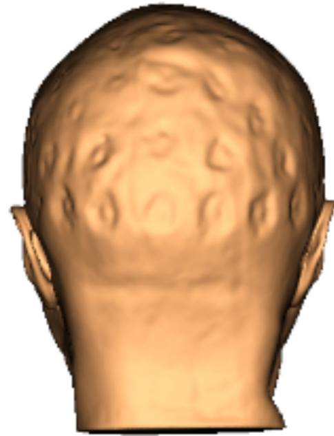
FIGURE 1 Gel artifacts visualized on the skull in Brainsight

The electrode positions on the scalp and cortex for each participant were translated into MNI space, using the affine transformation matrix