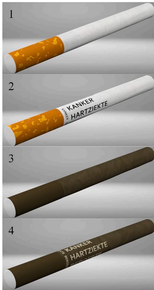
Fig. 2. Cigarettes used in second study, 1: a regular cigarette; 2: cancer, heart disease, stroke; 3: drab dark brown; 4: drab dark brown combined with ‘cancer, heart disease, stroke’.

certain’ (10) (Moodie et al., 2019; Juster, 1966). This is a relevant measure as most adolescents obtain cigarettes via their friends (van Dorsselaer et al., 2015), and this question is predictive of smoking initiation among adolescents (Morello et al., 2018).