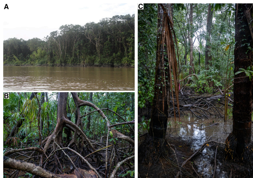
Figure 2. Mangrove stands in the Amazon Delta

(A) View of the forest fringe of estuarine mangroves in the Amazon Delta.