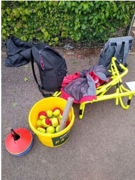
Plate 3. Student A lesson evaluation.