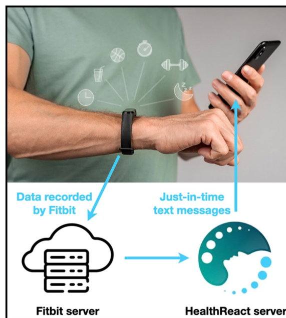
Fig. 2 Scheme of the HealthReact system. The HealthReact system triggers sending out just-in-time text messages based on data recorded by the Fitbit tracker

The mHealth intervention is enabled by the HealthReact system developed at the University of Hradec Kralove [73]. HealthReact consists of a server-side application connected to the Fitbit server and thus can trigger sending out just-in-time text messages based on the data recorded by the Fitbit tracker (Fig. 2). Researchers can choose from a wide variety of just-in-time triggers to suit study objectives and adapt the triggers to the specific needs of individual patients. The HealthReact system enables the setting of certain parameters to regulate the