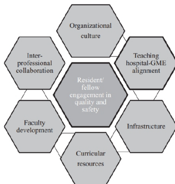
Figure 1 Tess et al 's 37 (2015) framework for integrating QI education. QI, quality improvement.

For the purpose of exploring 'contexts', this review protocol will draw on Tess et al 's conceptual framework of integrating quality and safety into medical education. 37 We did not come across a similar model which exists for nurse education in the literature. The concepts in their model will form our preliminary investigation into the contexts APPs might operate under. The contexts we are initially guided towards, but will not be restricted by, are organisational culture, academic-practice alignment, infrastructure, curricular resources, faculty-practice