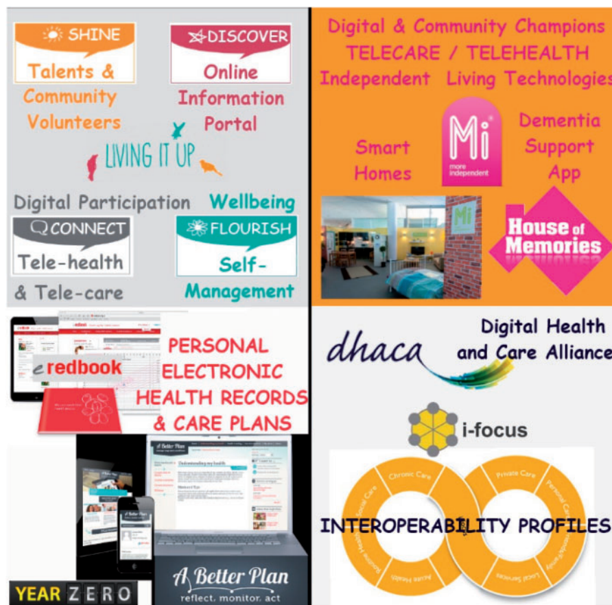
Figure 1: The 4 multi-agency dallas consortia.

University of Glasgow ethical approval was granted for this study. All respondents provided consent for participation. Identities are protected