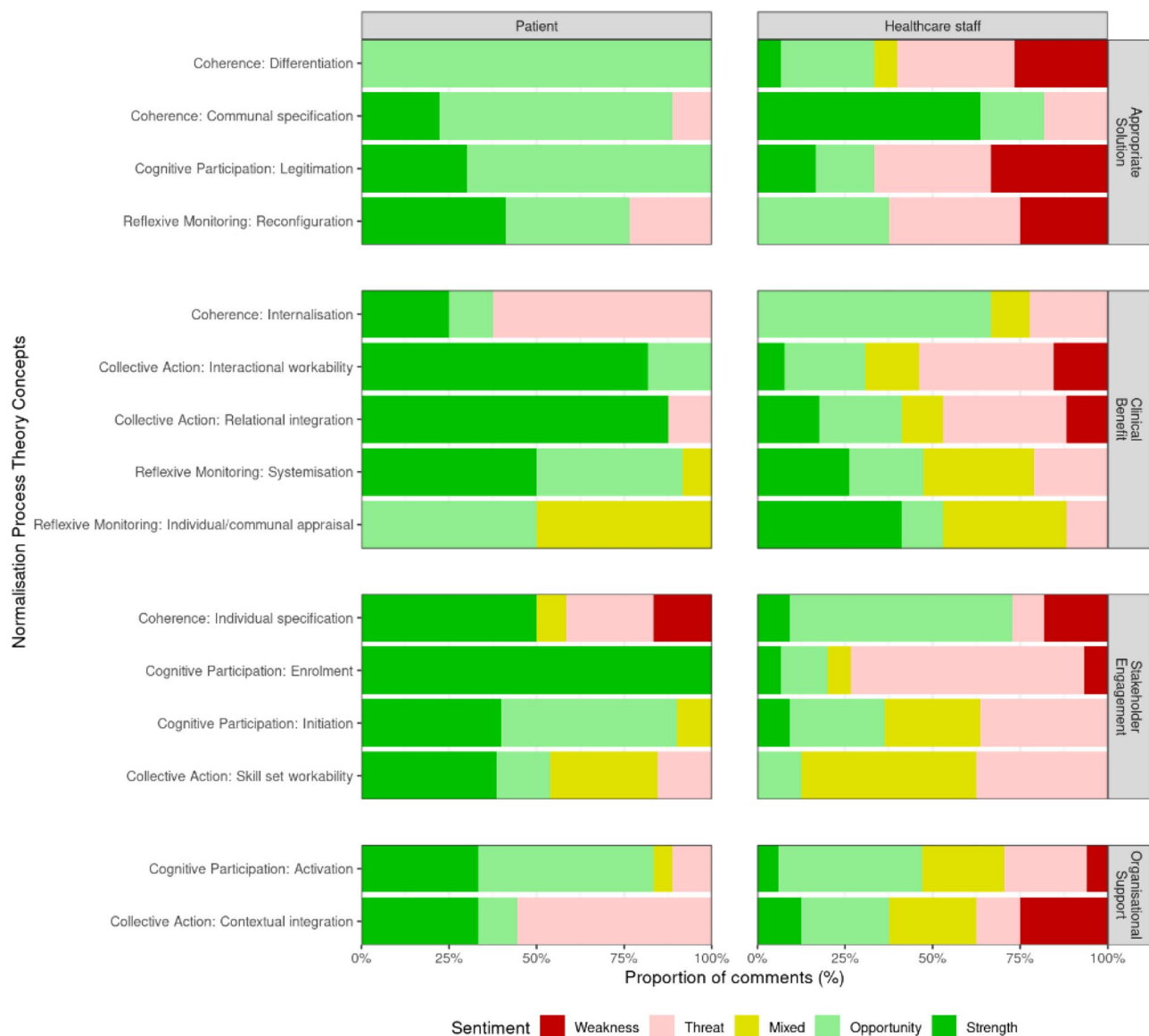
Fig. 1 Comparison of stakeholder sentiment regarding implementation of remote postoperative monitoring, according to Normalisation Process Theory concepts

An important step towards a novel intervention becoming normalised, consists in an agreement emerging among stakeholders that there is an appropriate clinical problem (i.e. an unmet care or service need) that the intervention has an important role in solving and that it differs in doing this from already existing and established practices [18]. From a patient perspective, there was a strong consensus that the advice received on discharge was either not given or basic ( "I don't remember anything written, verbally it was it looks fine...I think I was told any worries to phone back or speak to GP. Basic advice" [R3]) and this was reinforced by the experiences of community healthcare staff ( "Sometimes it is maybe a slight communication problem [between patients and the