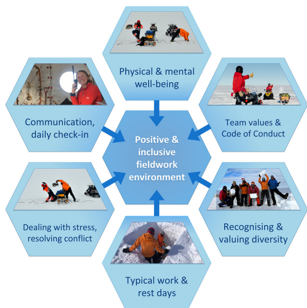
Figure 3. Visual representation of important topics covered during the ITGC facilitated pre-field season conversations to build a positive and inclusive field work culture.

social interaction tools to promote personal and introspective discussions between team members with respect to work-life balance, conflict recognition and resolution, and prospective roles and hierarchies in the field.