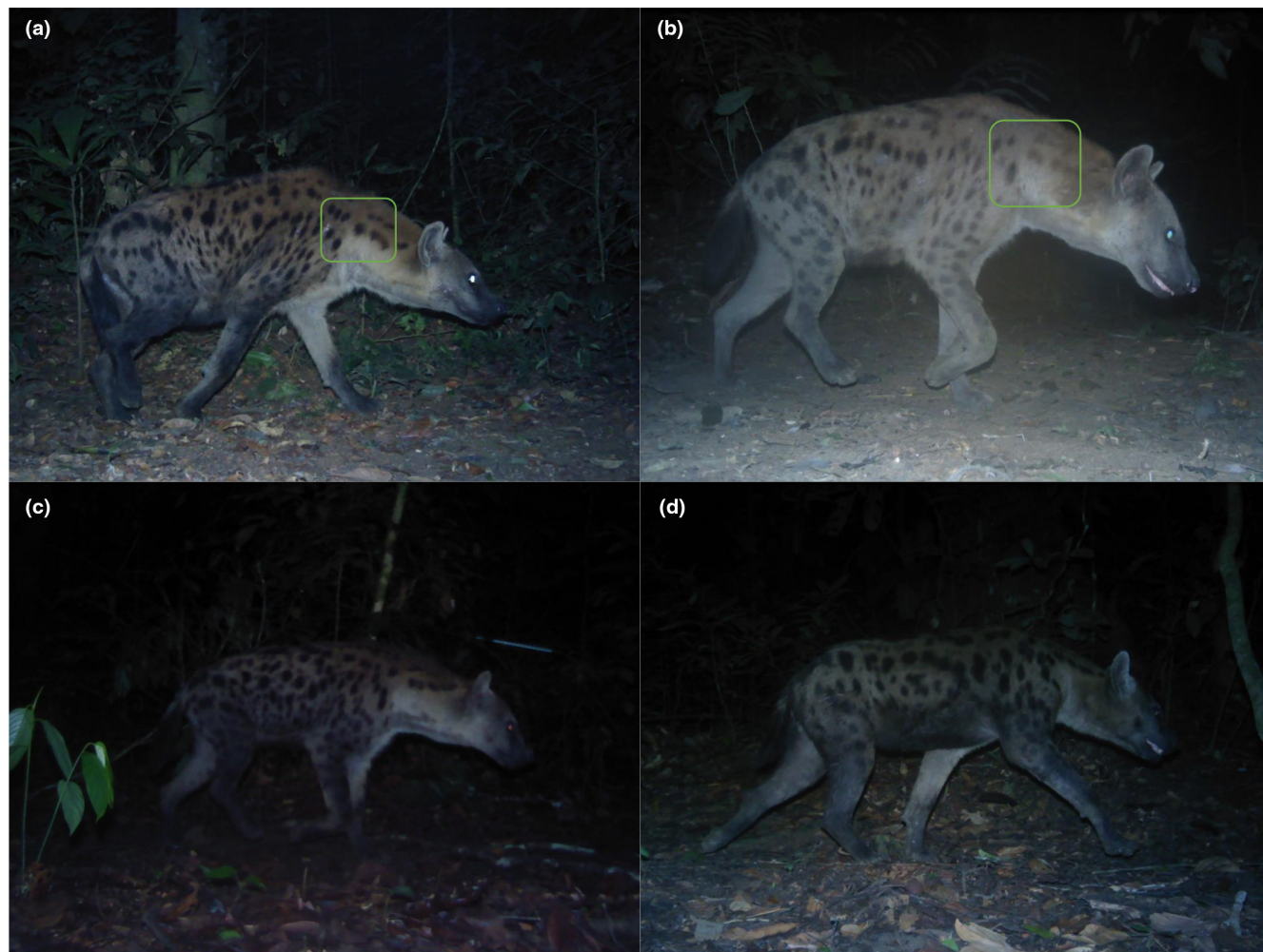
FIGURE 2 Right flanks of the four individuals identified in the Momba area. The green boxes superimposed on images (a) and (b) show the different spot patterns seen in these two individuals.

had been ongoing throughout and thus her absence from August 2019 to 2021 was confirmed and not due to a gap in survey work at the site.