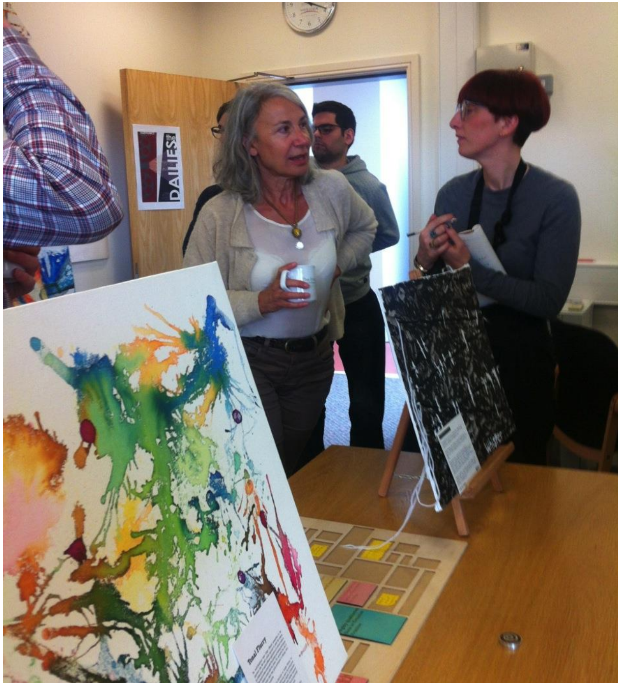
Figure 3. Discussion amongst work 'in the making', Moray, March 2016

The second set of Dailies were held in July and included representation from the PGT and PGR student cohort. As well as members of the research cohort of PhD and MRES candidates, MDES students gave presentations about their group projects, which began in January 2015. A representative from the programme discussed her team's project, Bike Hub, sparking wide interest from the audience. Bike Hub proposes the creation of a series of shelters throughout Barra. Young people would be encouraged to take ownership of the Bike Hubs and decide what they are used for. Inspired by interviews with young people and Barra Youth Café, the suggestion from the MDES students is that they could become maker spaces or meeting places. The team of three was given the theme of environmental design and the topic of health and wellbeing during Winter School. During their research the group decided to focus on Barra and became interested in how wellbeing was linked to creativity and having a good relationship with place and landscape. Field research