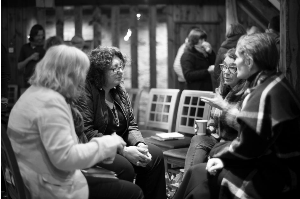
Figure 2. Group discussion at the Gathering at Brodie Castle, September 2015