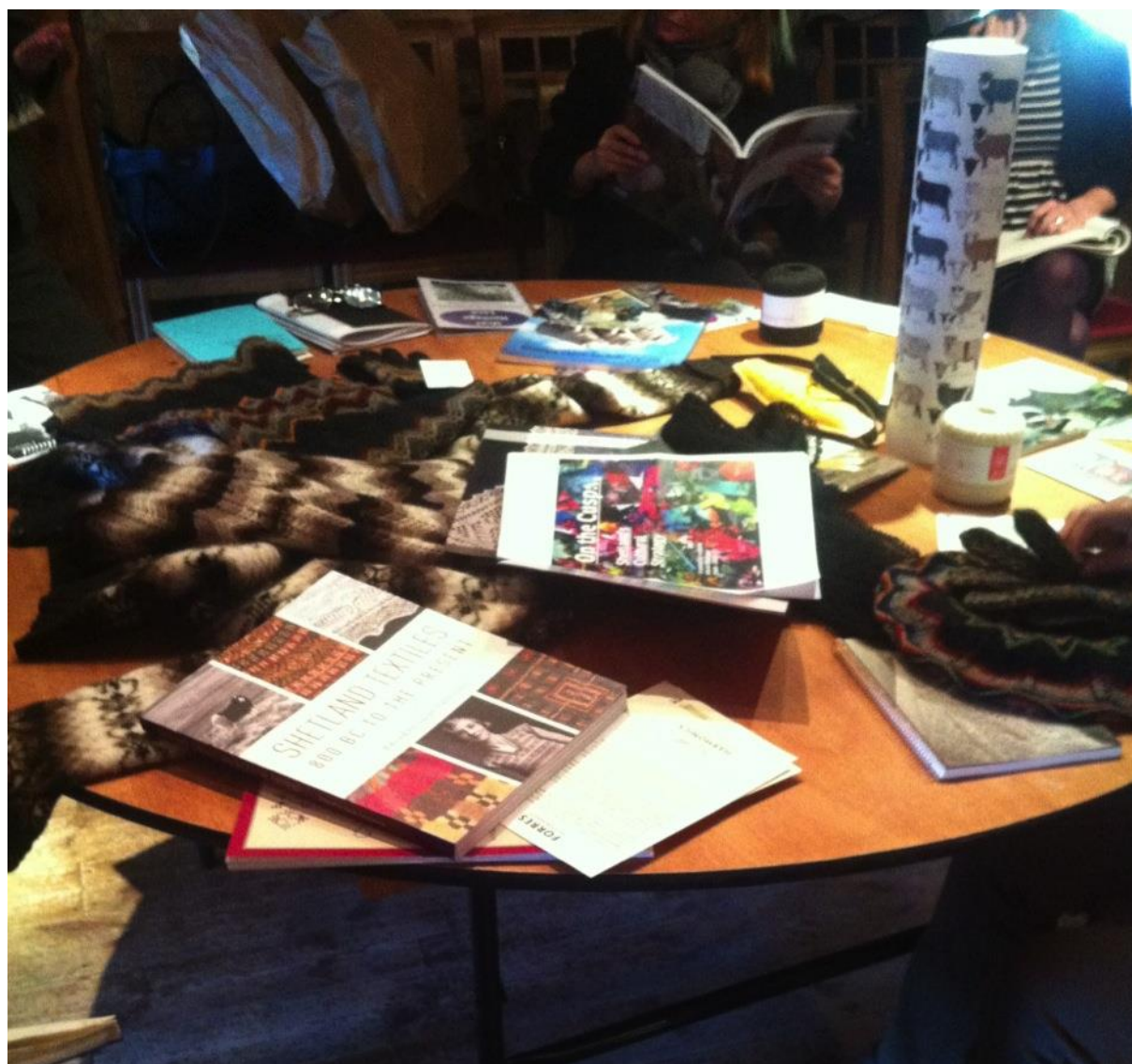
Figure 1- Material artefacts shared at the Gathering at Brodie Castle, September 2015

At the September gathering GSA reviewed possible approaches to enlightened evaluation with the help of a range of experts. Focusing on the CFP projects underway and using the material artefacts gathered on trips to the Western Isles and Shetland as well as other activities, participants reflected on the journey taken so far and shared their experiences. At the second 'major' November meeting HIE and GSA met 'en masse' to consider Harmonics for the first time. The work concentrated on: what had been the experience of HIE and GSA staff of the partnership to date; and, what preferable futures might be springing from the partnership. GSA and HIE people participated with frank and enthusiastic engagement and energy for the partnership was high. A clear question was foregrounded by participants: What is the 'partnership space', as opposed to GSA and HIE spaces? As one participant described "There is a huge amount of creativity in both organisations and it's how we join forces and meld that creativity for the wider socio and economic development of the Highlands and Islands".