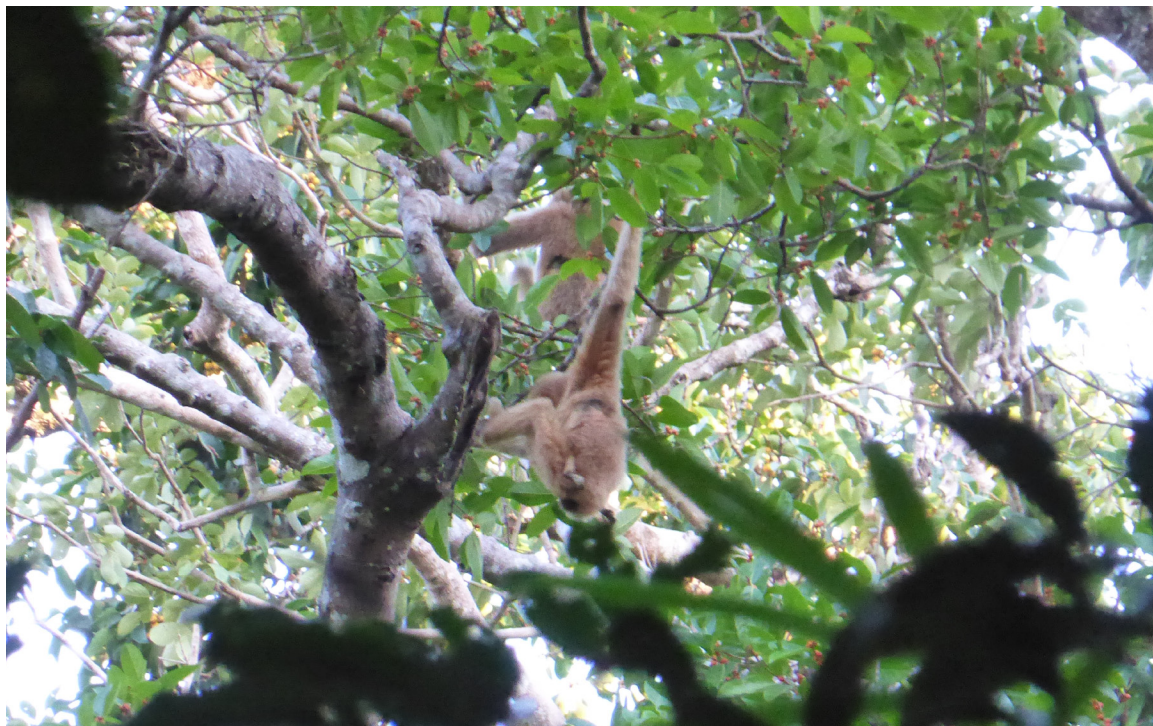
Fig. 2. The image shows the two females from G2 holding their respective infants. The infant in the foreground is more obvious and the arm and leg can be seen in the mother's fur. The second can be seen from the black colouring on the back of the female, which is the black hand of her infant clinging to her fur.

On 26 June 2015 the group G2 was seen feeding, and the two adult females were clearly observed as they fed separately. For the first time the infants, who had always been seen attached to their respective mothers, were seen playing and practising swinging around their mothers as they fed. A few days later,