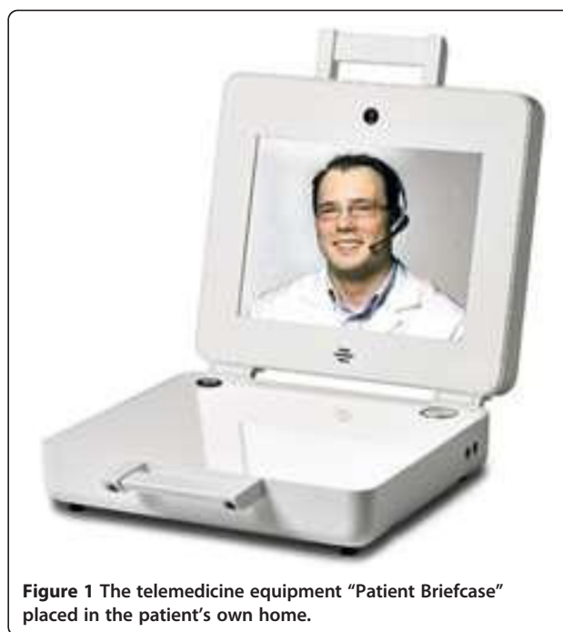
Figure 1 The telemedicine equipment “Patient Briefcase” placed in the patient’s own home.

The telemedicine videoconferencing equipment was designed to look like a briefcase and was known as the “Patient Briefcase”. The briefcase contained a screen, microphone, an on/off switch and a volume control (Figure 1). A camera was installed in the patient’s home together with the briefcase. The camera made it possible to follow the patients’ movements around the room during the training session. A pulse oximeter was used to monitor saturation and heart rate. The therapist’s equipment consisted of a computer with an in-built webcam and microphone, a second display for reading patient measurements and a computer for the electronic patient record. Communication took place via the internet (ADSL), wireless or satellite communication, and measurements were transferred from the patient’s home to the hospital in a closed secure system. Thus only invited users could participate in, view or hear the