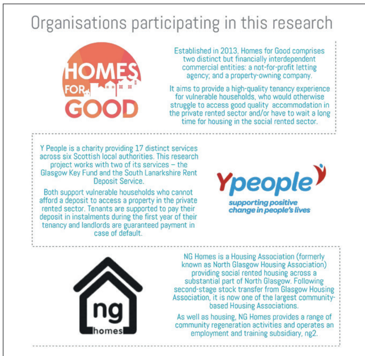
Figure 3: Organisations participating in this research.

Phase 2 of this research will work with three quite different social enterprises operating in Greater Glasgow's housing sector, which are outlined in Figure 3. It will consider the tenancy support, housing quality, affordability and sense of community they provide, and assess how this impacts on the health and wellbeing of their tenants. Of particular interest will be the ways in which the subtly different social missions of these three organisations are balanced with their various business needs, and how this feeds into the organisations' values, cultures and practices.