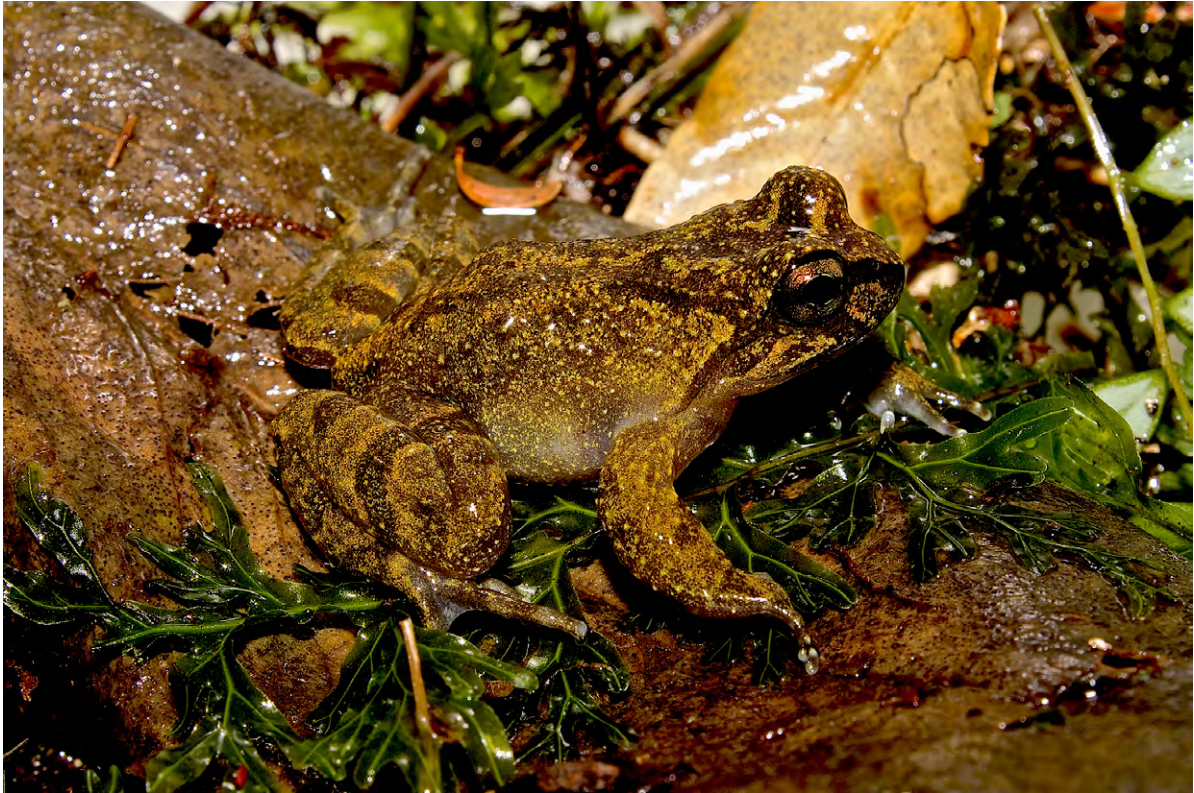
Figure 2. An adult male Insuetophrynus acarpicus from Llancahue.

narrow distribution, and aquatic habitat specialization.