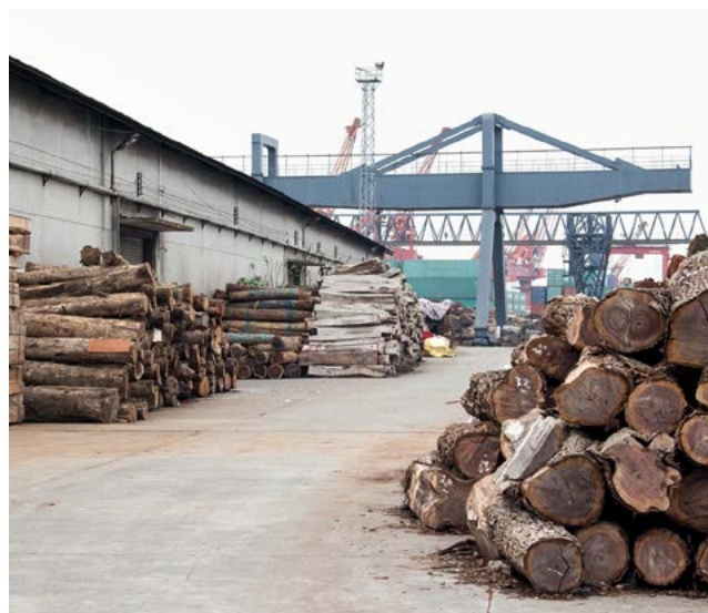
Stock of logs and sawnwood at Canton harbour (China)

After considering the definitions of illegality in timber importing countries, the next section addresses those of producing countries, including countries that have signed Voluntary Partnership Agreements (VPAs) with the European Union, and Brazil, the country with the largest forest area and illegal forest clearing estimated at between 68