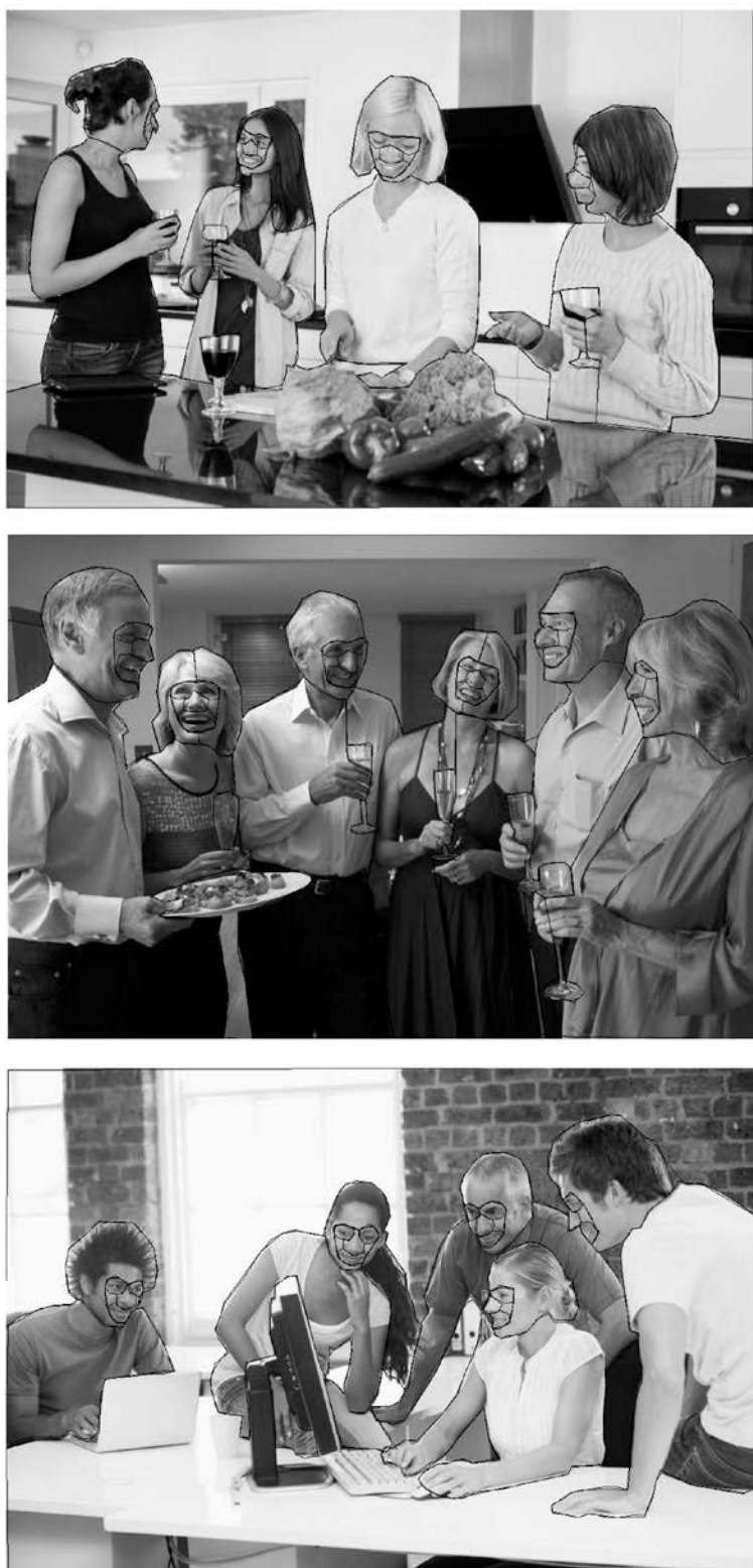
Figure 1. Example stimuli from Experiments 1 and 2. Black lines represent AOIs. In both experiments the images were displayed in colour.