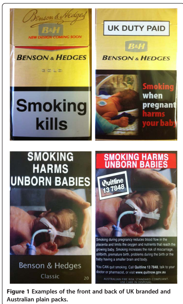
Figure 1 Examples of the front and back of UK branded and Australian plain packs.