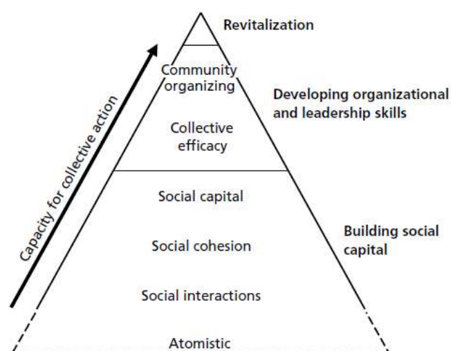
Figure 1: Hierarchy of capacities

McCarthy et al. (2004) suggest a framework for bringing these social benefits together to form a simplified theory to describe how these various ideas might relate to each other (Figure 1). Social benefits are gained at each stage, and each stage is important. Each stage must be built on the stage below it, but the challenges are likely to increase as a community works its way up the pyramid. For example, community revitalization involves collaboration across groups and issues and sustained collective action and co-operation over time.