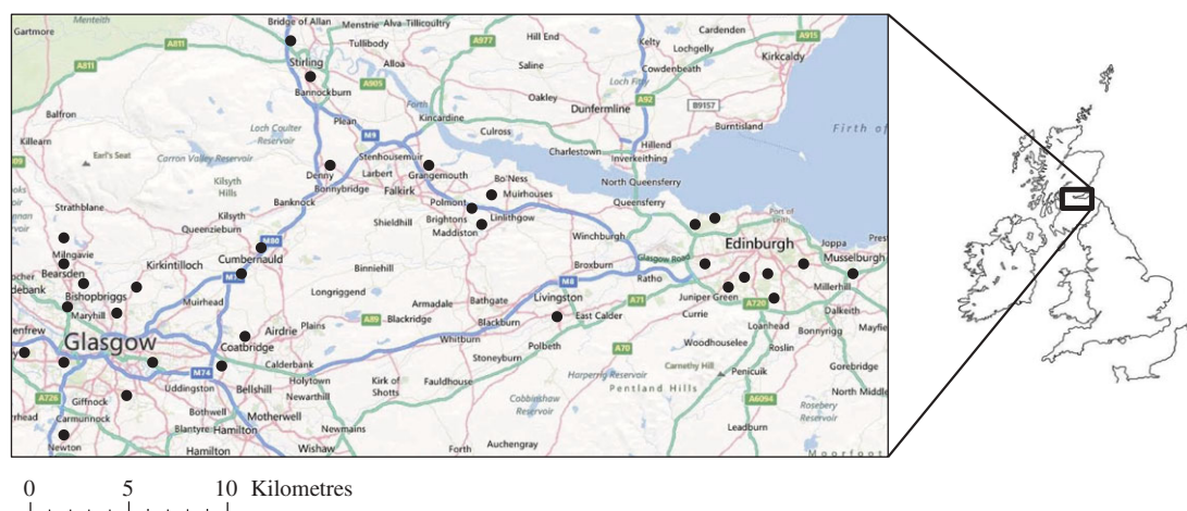
Figure 2. Map of central Scotland showing approximate locations of woodland sites (black dots) surveyed in 2011.