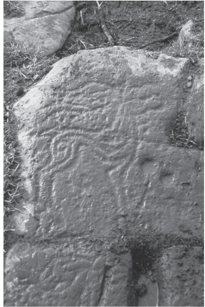
Figure 7.7. An example of the carvings at Eggerness, Dumfries and Galloway, which have now been covered up for protection.

At Ormaig in Argyll, a significant part of which was only discovered in 1972–1975, anecdotal evidence suggests that this once fresh carving is weathering fast, but there are local concerns about recovering such a fascinating site. One of the more unusual conservation actions taken by Historic Scotland is at Dunadd hillfort, a monument in State care. Important early medieval bedrock carvings have been covered with a synthetic stone cast for the last 25 years (Figure 7.8).