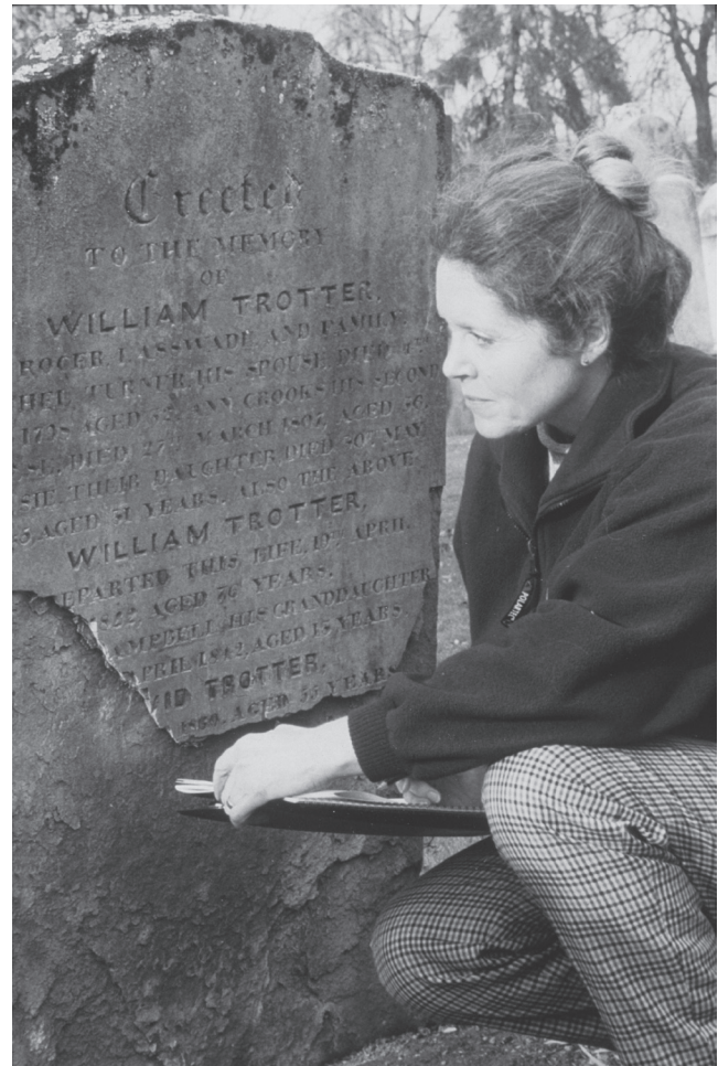
Figure 7.4. Monument wardens being trained in the assessment of carved stone decay.

While Monument Wardens are not recording change in the condition of stones at the micro level, their broader-brush assessments of the condition of monuments have now been recorded in a database spanning the last 15 years. This means we recognise the categories of problems affecting rock art, whether nature, farming, forestry and development/human intervention, and where this is happening. In terms of nature, weathering, moss, lichen, overhanging vegetation and bracken are all perceived as problems. When it comes to farming, cattle congregate on some sites, grazing can cause minor erosion around stones and, unfortunately, there is the occasional incidence of loss from destruction through quarrying or ploughing. The main distribution of rock art coincides with parts of Scotland that are heavily afforested. Problems here have included windblown trees falling on sites, tree planting in the immediate vicinity, timber extraction taking place across stones and other works, such as track creation, that have inadvertently damaged or destroyed a site. Low Clachaig was the finest cup-and-ring marked boulder in Kintyre until it was inadvertently damaged in 1989 by the creation of a new forest track. This grim discovery was made by the Monument Warden in 1992.