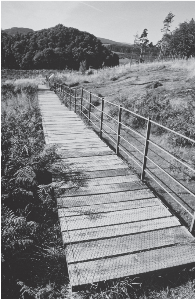
Figure 7.6. Raised walkway at Achnabreck, Argyll, prehistoric rock-art in the care of Scottish Ministers.