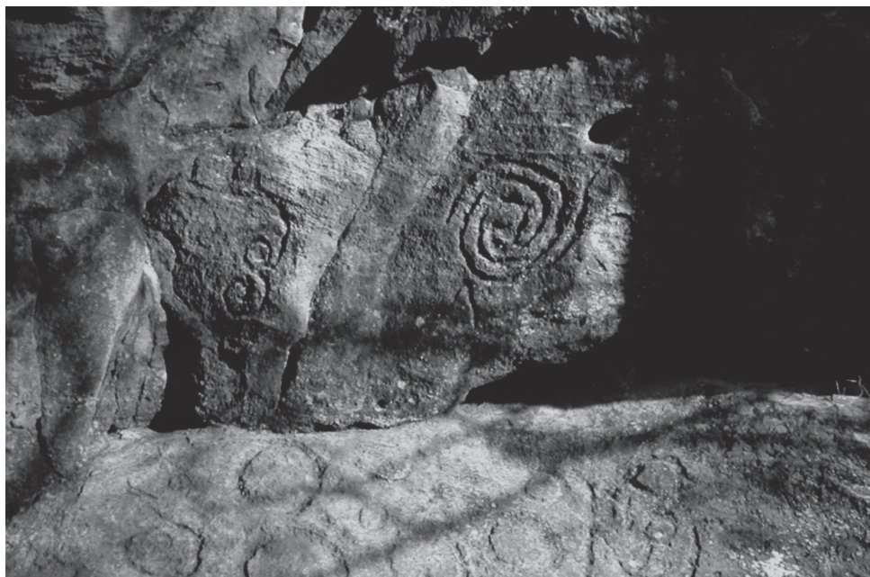
Figure 7.2. Detail of the carvings in the cave at Hawthornden.