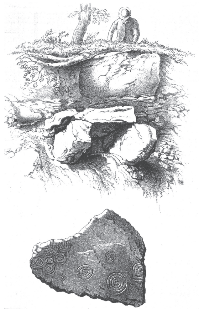
Figure 7.1. 'Craigie-Hill, Linlithgowshire'.

Its very unfamiliarity therefore seems to have made it less attractive to serious scholarship. As Simpson noted, 'they are too decidedly 'things of the past' for even the most traditional of human races to have retained the slightest recollection of them' (Simpson 1865, 107). This may also go some way to explaining why, in contrast to early medieval sculpture (see Jones 2004), prehistoric rock art does not apparently play such a significant part in defining present local identity and sense of place.