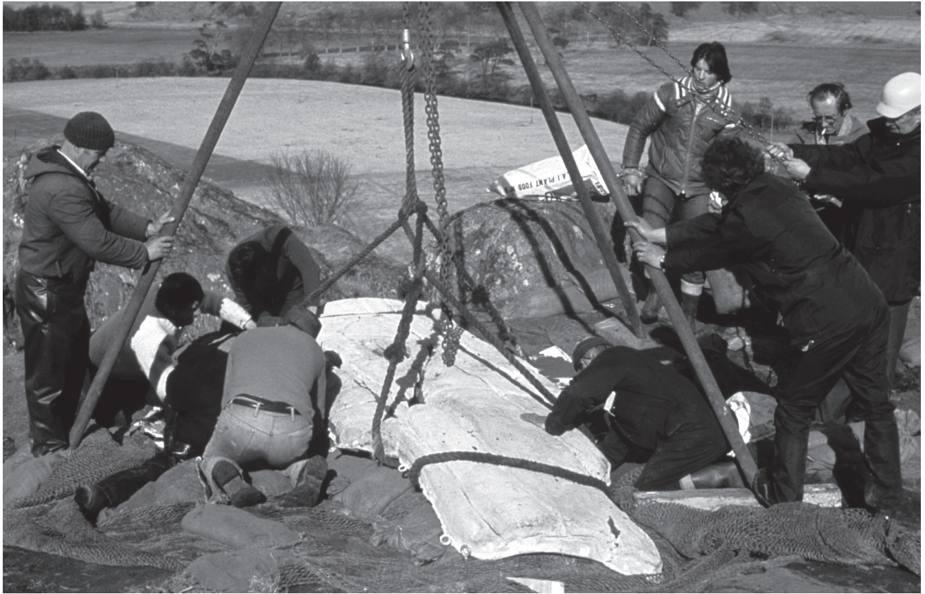
Figure 7.8. Important early medieval bedrock carvings at Dunadd being covered with a synthetic stone cast.