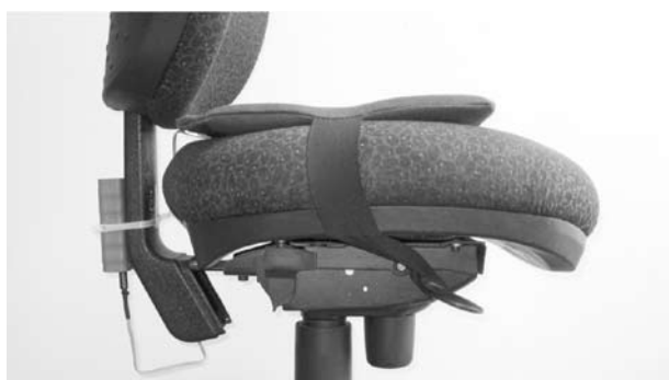
Fig. 1. Side view of the sitting pad on an office chair. Not commercially available (Australia, 2011).

to detect transitions of greater than 3 seconds to and from the seat, and a microcontroller ( 11.5 \times 5 \times 3 cm; RF Technology, Brisbane, Australia) which records a time stamp for each transition. Manufacturer and researcher beta testing for sensitivity found 3 seconds to be the most accurate threshold for detecting a transition, with a minimum load of 3 kg and no biologically plausible maximum load. Data are downloaded using a proprietary software package which produces a Microsoft Excel output for data analysis.