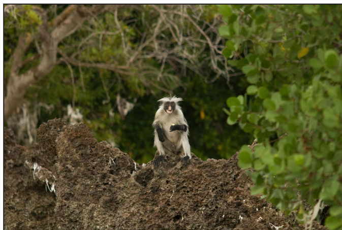
Figure 3. Adult male Zanzibar red colobus Procolobus kirkii eating mangrove flowers on coral rag, southern Uzi Island, Zanzibar Archipelago, Tanzania.

tended to be associated with lower numbers of monkey sightings, with an exception in Uzi, where Sykes's monkey and human encounter rates tended to correlate, suggesting their use of relatively disturbed forest at this site (Table 2).