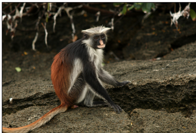
Figure 4. Adult male Zanzibar red colobus Procolobus kirkii sits on jagged coral rock formation, Vundwe Island, Zanzibar.

The results of these surveys, while conducted almost a decade ago, are suggestive of the relative value of degraded habitats to colobus and Sykes's monkeys. This value may