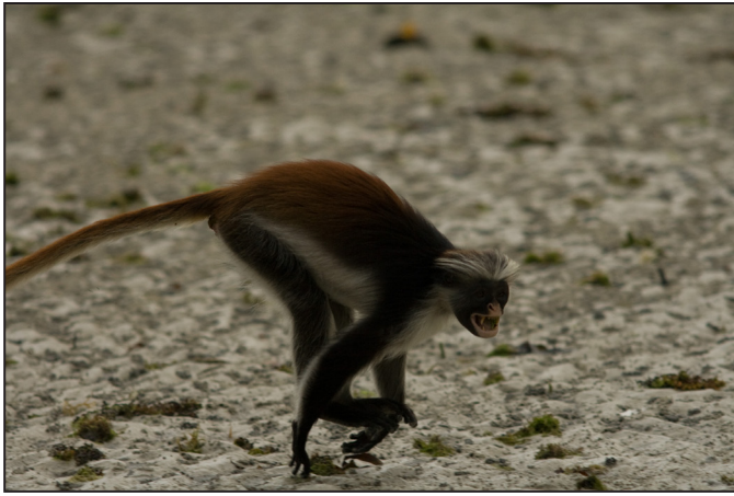
Figure 5. Adult male Zanzibar red colobus Procolobus kirkii running along a sandy beach, Vundwe Island, Zanzibar Archipelago, Tanzania.

Tana, Kenya, where P. rufomitratus lives at high densities of 165 individuals/km 2 (similar to the density of red colobus estimated in Uzi). The farm-field groups in Siex's study (Siex 2003), at a population density more than double of those in the Jozani groundwater forest (550 monkeys/km 2 compared with 235 monkey/km 2 ), were highly unstable and living at high densities because of habitat compression rather than intrinsic growth.