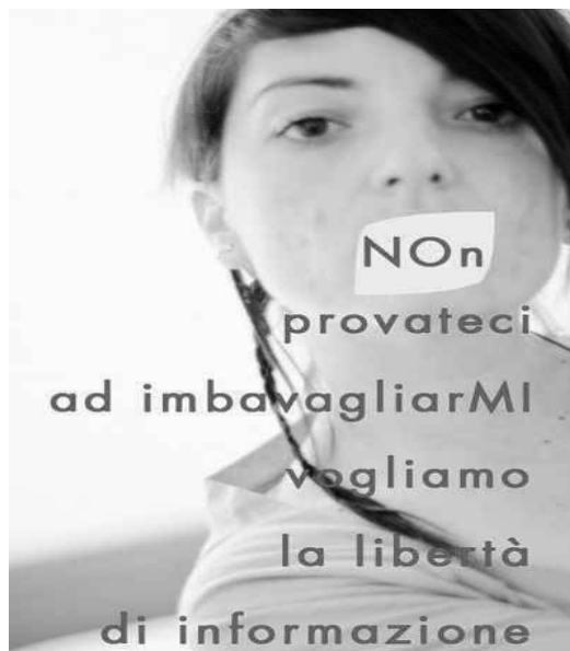
Figure 2: The Poster Displayed at the Libera Informazione Events

from the Libera Informazione , the persuasion impact of emotions should be realised publicly not only by illustrating emotions of the criminals but also the victims.