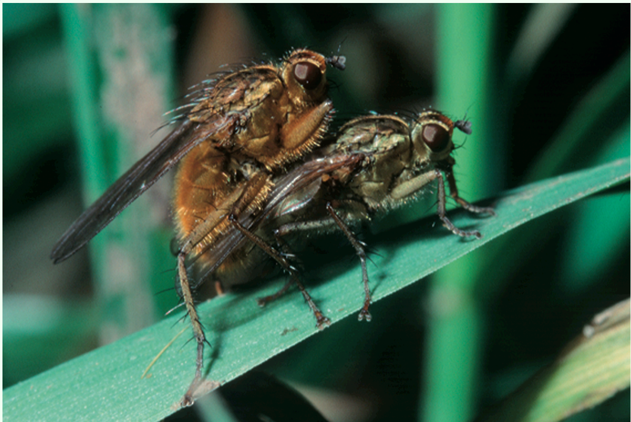
Figure 1 Copulating pair of S. Stercoraria . High quality figures are available online.

probably a closely related sister species, S. soror (Werner et al. 2006). It is not reported from anywhere else in the southern hemisphere. In North-Central Europe, S. stercoraria is one of the most abundant and widespread insect species associated with cow dung, although some similar scathophagid species may co-occur on cattle pastures, depending on location, but usually at much lower densities (e.g. S. furcata in North America and S. inquinata , S. suilla , and S. lutaria in Europe). The species' distribution pattern is likely influenced by human agricultural practices. While S. stercoraria is considered a cow-dung specialist, it can successfully breed on dung of other large mammals such as sheep (Hirschberger and Degro 1996), horse, deer, or wild boar (Blanckenhorn et al., unpublished data).