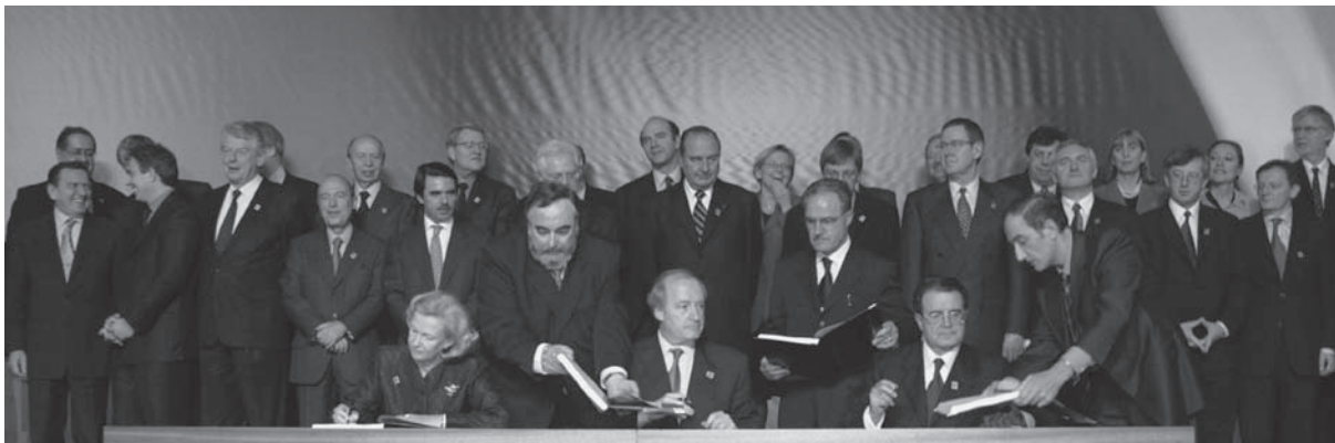
Signature of the EU Charter of Fundamental Rights, December 2000

The Charter was first proclaimed in 2000 in Nice and was then incorporated into the failed Constitutional Treaty. Sparked by the 50th anniversary of the United Nations' 1948 Universal Declaration of Human Rights, a debate began regarding the need for a catalogue of fundamental rights in the European Union. In an effort to increase the visibility of fundamental rights in the European Union through consolidation in a comprehensive document, the process leading to the development and adoption of the Charter was launched. 75 The Charter's provisions have been influenced primarily by the European Convention on Human Rights but also by the EU Treaty, European Court of Justice case law, and the constitutional traditions of the member states. The Charter is contained in a separate document from the Lisbon Treaty but remains an instrument of soft law until the Lisbon Treaty enters into force. The Lisbon Treaty will give the Charter binding legal effect by the insertion of an amendment into article 6 which results in it having the same legal value as the Treaties. Despite this absence of legal effect so far, the European Court of Justice has referred to the Charter's provisions in an ever-growing number of cases. 76 It therefore remains to be discussed whether the Charter will add any value to fundamental rights protection and the fight against of racism and discrimination in the European Union.