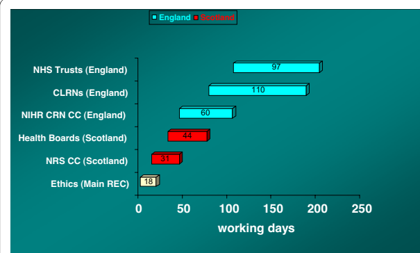
Figure 2 Time taken for NHS Governance Approvals and Permission (excluding non-responses).

By the time we drew a halt on trying to obtain R&D approvals and permission and could begin to plan an accurate schedule for recruiting and interviewing individual respondents, the original schedule for the fieldwork had effectively been delayed by about 4 months, requiring