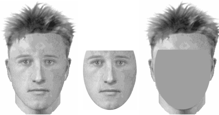
Figure 1. Example stimuli of the UK pop singer Ian 'H' Watkins. Participants inspected complete composites (left), internal composite features (centre), or external composite features (right).

Three sets of composites were used. These were the set of 40 from Frowd et al. which had been constructed from E-FIT, PRO-fit, Sketch and EvoFIT, referred to as 'complete' composites, plus two additional preparations: a set containing the internal features and another set containing the external features. The internal composite features were prepared in Adobe Photoshop by highlighting the internal facial features of these composites in the shape of an oval and then truncating just above the eyebrows, to omit the forehead that sometimes contained hair. As can be seen in Figure 1, the external composite features were produced by simply covering the previously defined internal features with a uniform grey mask.